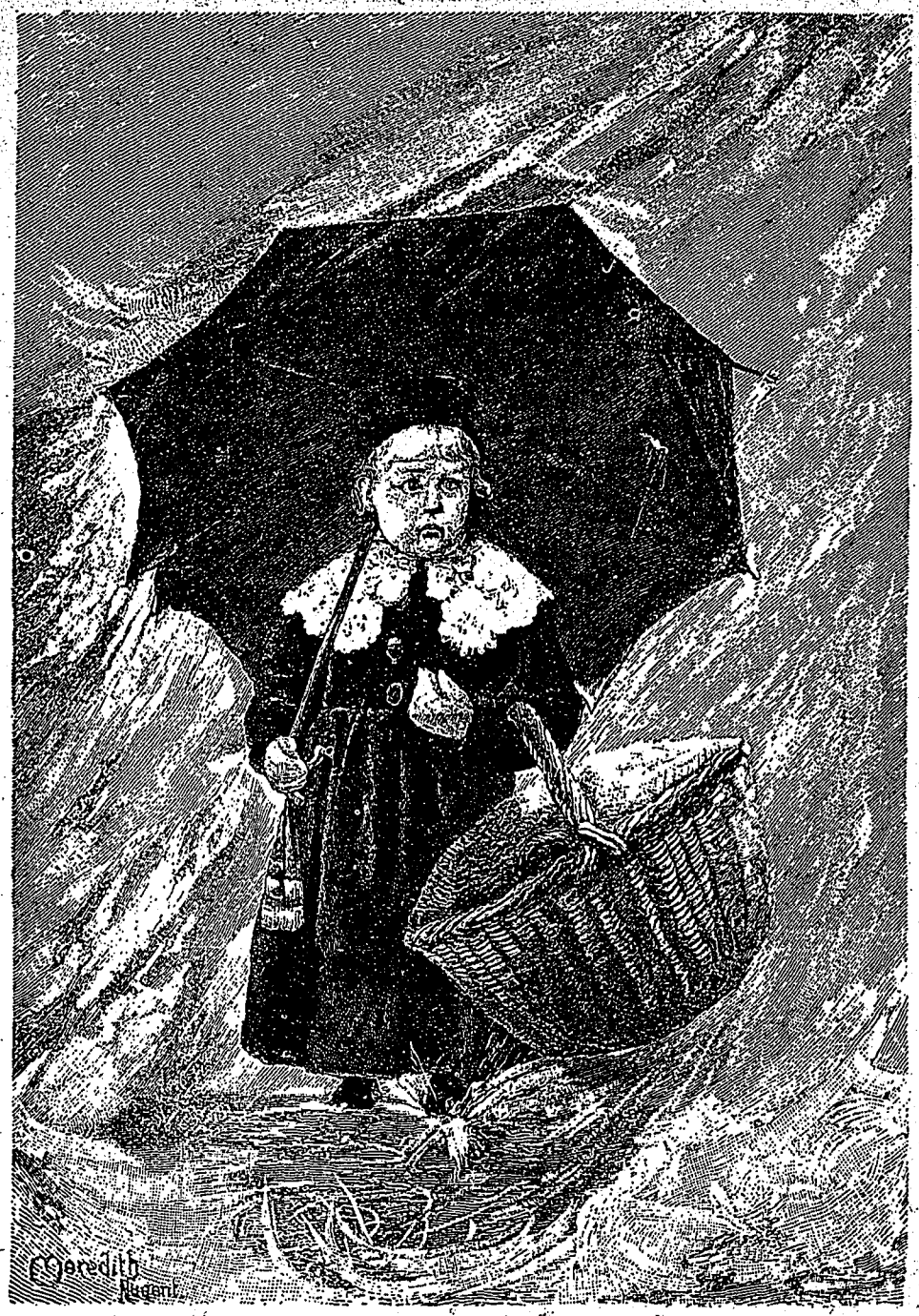
BAD DAY FOR MARKETING.