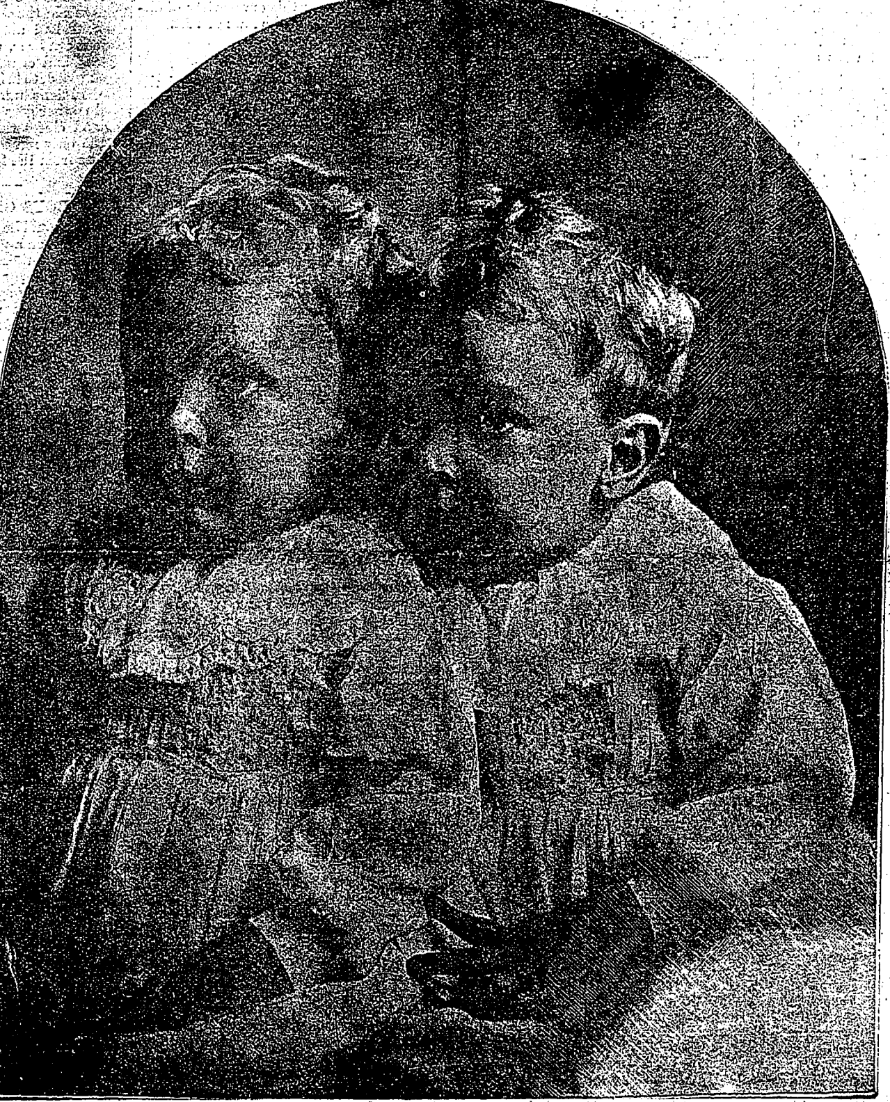
-" WHO KNOWS THE THOUGHTS OF A CHILD ?"

"I know some of the societies, of which our town has its quota, consider us nig-gardly and uncharitable, and am truly sorry for it. But what are we to do? Their objects do not always commend Their objects do not always commend themselves to our judgment as true 'charity,' and so I dare not appropriate the Lord's money to them. Of our own, you see, we have little to spare." "And when you come into close places yourself, needing money badly, and there happens to be some in the 'Box,' don't you ever feel tempted to borrow, and resulted them?"