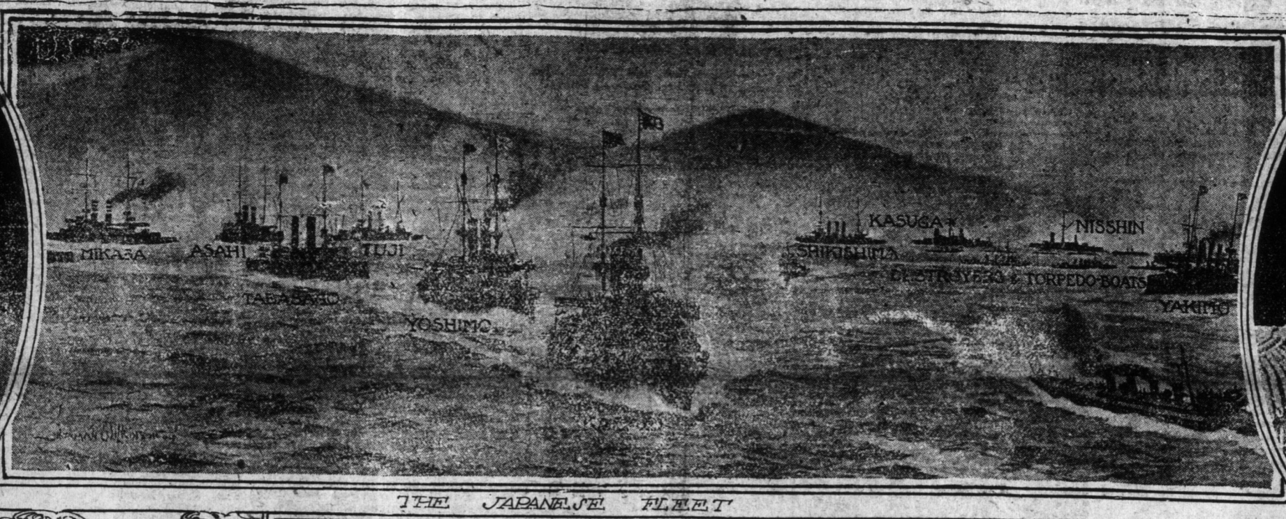
THE JAPANESE FLEET