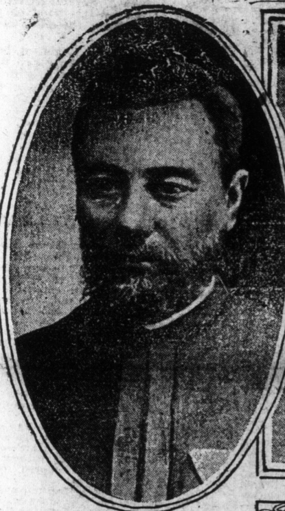
VICE ADMIRAL TOGO