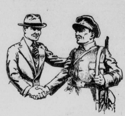
chain of Service unbroken till the end.

We ask now your continued sympathy and support for Red Triangle Service for our Soldiers during demobilization, and for Y.M.C.A. work for Canada generally during the Reconstruction period. The Annual Red Triangle campaign will be held throughout Canada May 5th to 9th, 1919. The objective is $1,100,000.