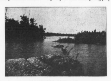
ISLANDS IN GEORGIAN BAY.

The pastor on whose circuit the above revival took place, quickly realized that the only way to hold these young people