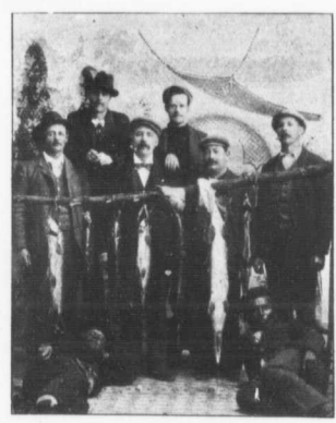
A GOOD CATCH.

tion will sometimes supply all the recreation that is needed. "Whatsoever things are true; whatsoever things are honorable; whatsoever things are just; whatsoever things are pure; whatsoever things are lovely; whatsoever things are of good report"—let us fix our minds on these things and we shall kill off most surely the desire for low or questionable forms of amusement