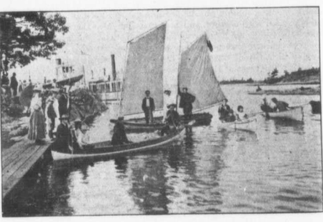
GETTING READY FOR A SAIL ON THE GEORGIAN BAY

First. That the age of greatest susceptibility and the best time for open decision and committal of the life to Christ is the earlier years of adolescence, say from twelve to sixteen or seventeen. Of these sixty boys nearly every one made their