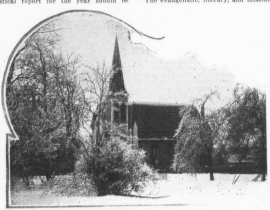
COCHRANE ST. CHURCH, ST. JOHN'S, NFLD.

The evangelistic, literary, and mission-