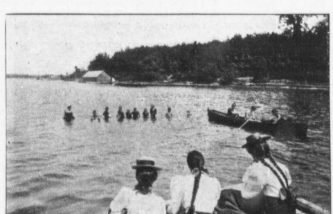
BATHING IN FRONT OF THE PENETANGUISHENE HOTEL.

I assume without discussing-for that surely at this hour