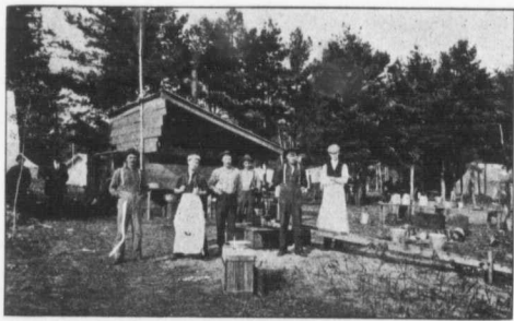
IRON CITY FISHING CLUB COOK-HOUSE, GEORGIAN BAY.

IN our last chapter of "The Parting of the Ways," we gave an account of the origin and ending of a group of forty or fifty boys whose energies were unrestrained and misguided. We saw these boys of splendid prospects "Sowing