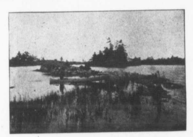
"THE ROCKS." GEORGIAN BAY.

(b) You tell me the amusement of the theatre does you no harm. Granted; but what of the harm it involves to those