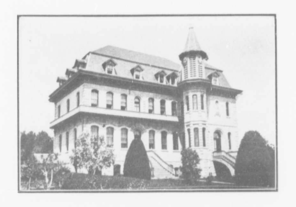
ST. ANN'S ACADEMY