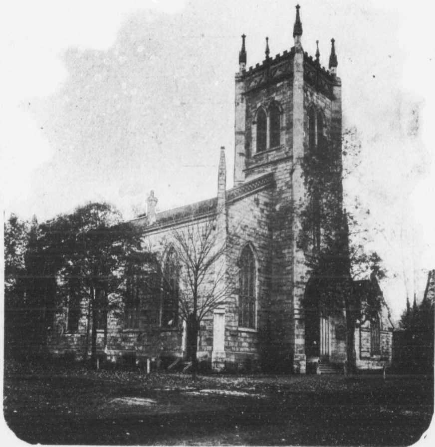
MACNAB STREET PRESBYTERIAN CHURCH, HAMILTON, ONTARIO CANADA