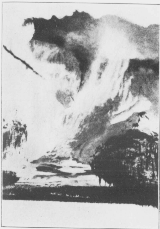
THE BIG FALLS IN WINTER

phant things loved Post. that, gifts e girl of his as his had e had pelts oods. m to e last New pened plans. ready eplen- as it stay Hope-