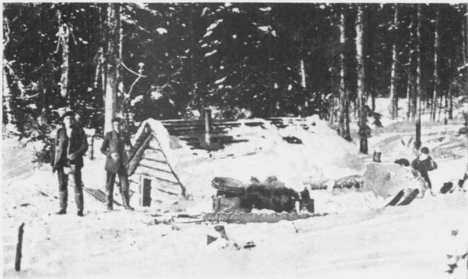
ACCOMMODATION FOR TOURISTS