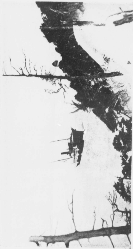
THE WRECK OF THE MAIL STEAMER

the eaty that had rawl The and gain. the they more and. n as rrier t all Well, as a and were hen ater new nees the ight eef, ped ing.