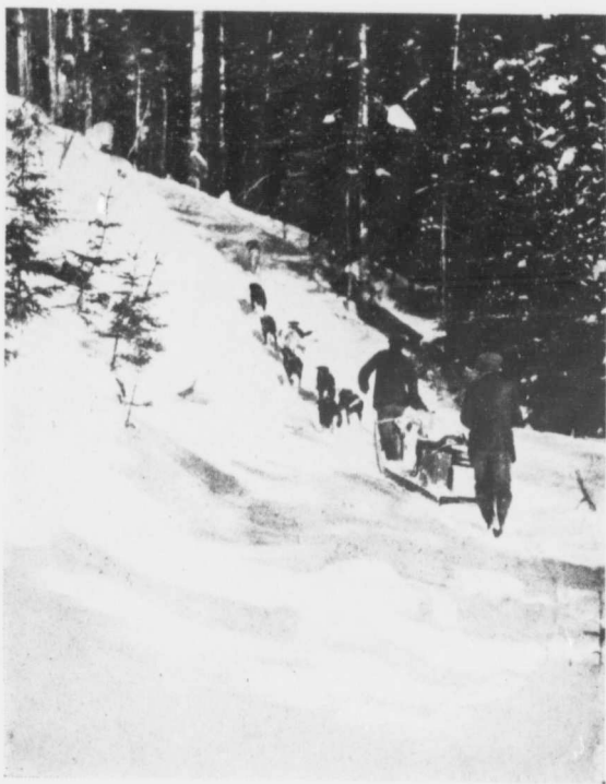
GOING THROUGH A BIG DROGUE