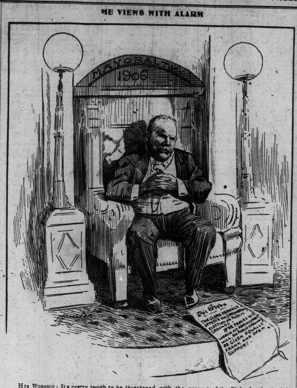
His Worsnip: It's pretty tough to be threatened with the support of the Globe simply doing one's duty.

Buy Bond No. 7. Mixture—the only cool, fragrant smoke in the world—special blend. Alvie Bollard.