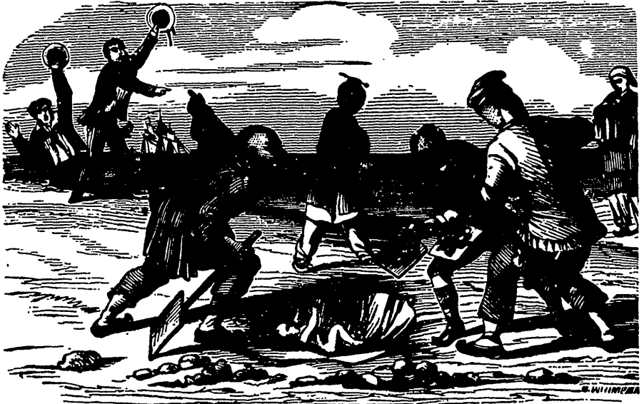
SAVING THE BABY.

The father and mother were standing a little off with a sacrifice of cooked meats and other offerings to be placed on the grave, and afterward to be taken home and eaten