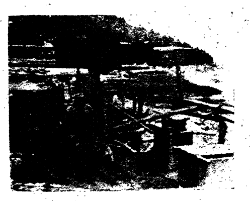
Making Oolachan Grease, Naas River.

of consequence were to be repaid by property of equal value, plus interest, which would be reckoned according to the length of time occupied by the recipient in reimbursing the donor. It will thus appear that this distribution of property was of great importance to Indians of all classes, as it not only affected them socially, tending to en-