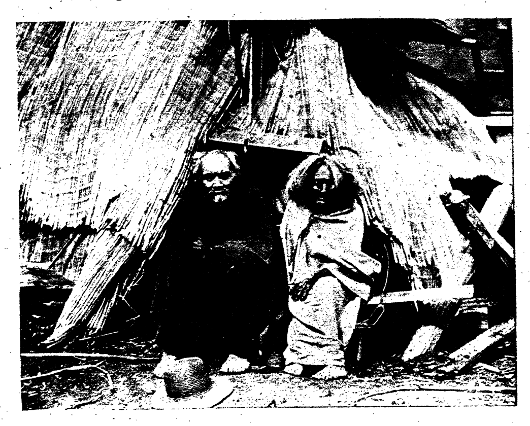
Chilarin (old man) and Tol Ramault (old woman) of Somenos Indian Village-both over 100 years of age.

cotic properties, and was smoked and otherwise used as tobacco, its name being that now applied to imported tobacco. It is not certain when potatoes were introduced amongst them, but as they have a native name for the vegetable it is probable that they may have obtained the plant from the south before the white man made his appearance. The kamas and other roots, bulbous and tuberous, were also extensively used by them as food. They