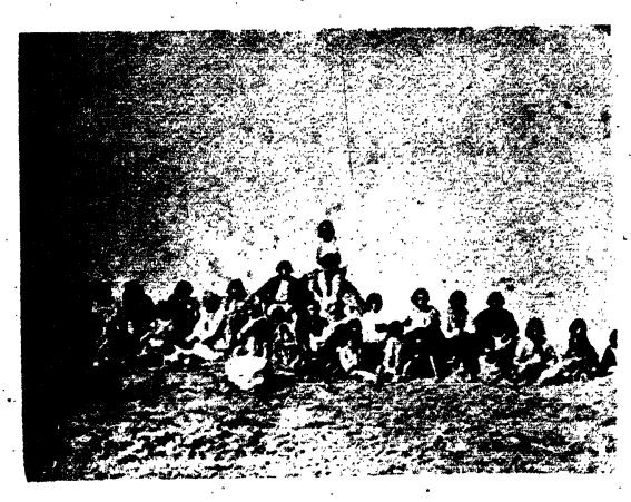
Thompson River Indians.

Indians of this Province would appear to be derived from three distinct languages, to which writers on the subject, from want of more appropriate terms, have given the somewhat arbitrary names of the Salish Kuak-yohl and Tinneh languages. Added to these is the Haidah, a fourth and distinct language, of which only one dialect exists. All the Indians speaking dialects of these languages hold traditions to the effect that they pushed their way from the north southward, the Tinneh Indians, whose congeners are still to be found in the Yukon and Mackenzie valleys, being the last migration. Their legends point to their having partly destroyed and partly intermarried with tribes who had occupied the country be-