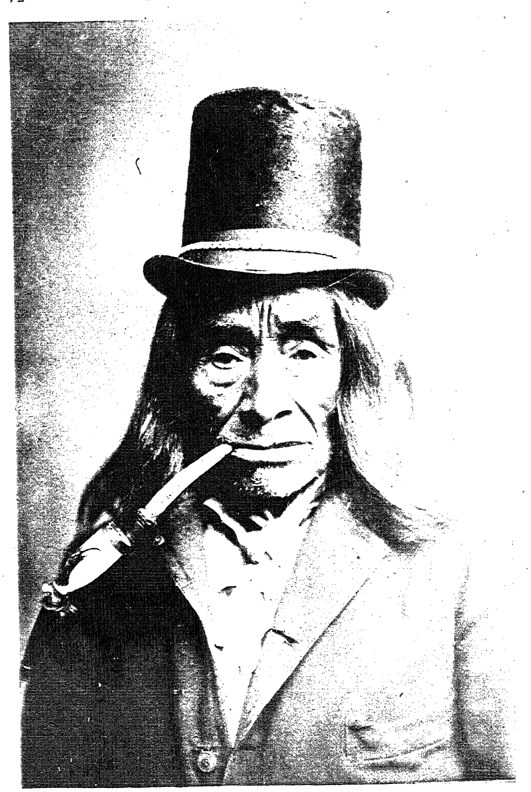
A typical patriarch offthe tribes.