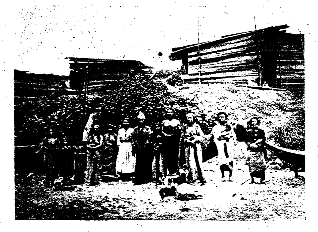
A Group of Vancouver Island Indians, in the sixties.

Comiakans, from Cowichan, and Sushwaps, from Kamloops. During the feast a disturbance took place with two bands who had a long-standing feud between them, which now culminated and ended in a fight. In the melee the Cowichans and Sushwaps decamped; but an excited young Sushwap got into a Comiakan canoe and was some distance off shore, sweeping down the swift Fraser before the mistake was discovered. The Comiakans, expecting the chief, suggested throwing the stranger