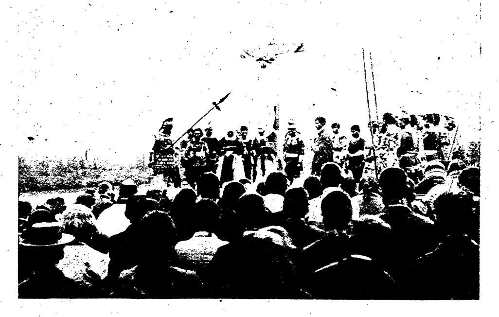
Indian Passion Play, St. Mary's Mission.

River. The Salish border the Tinnehs in the north, on the south they extend far into the United States territories. and in British Columbia from the Rocky Mountains to the shores of the Gulf of Georgia. Three bands of Salish are found on Dean's Canal, and at North and South Bentick Arm they appear to have pushed the Kuakyohl races westward to the outer sea coast on the Pacific Ocean. In this part of the Province these three bands of Salish are separated from their congeners to the south by the Tinnehs of Chilcotin and kindred bands. The Kuakyohl bands occupy the country beginning a little