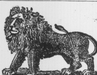
How's the Boy's Suit? Is it beginning to show signs of wear? Put him in "Lion Brand" the strongest, toughest clothing that's made for boys.

Corsets: We carry a full line of B. & L. D. & A. and P. C. Corsets. Call and see them.