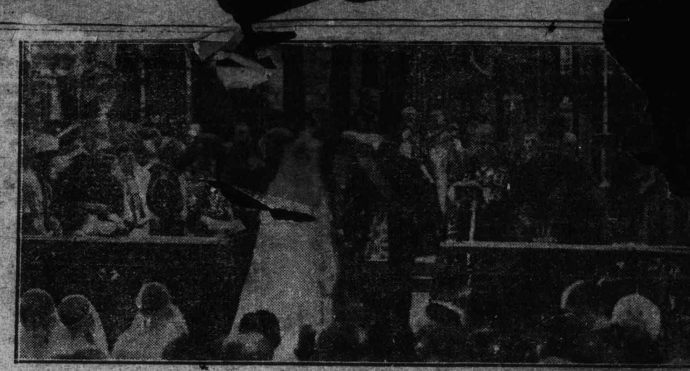
Princess Mary and Lord Lascelles at the altar in Westminster Abber. The officiality of the bridesmalds are shown in the photograph. The King stands at the left of the bride.

A despatch from Berlin says: The debate on the budget was resumed. The Democrats indignantly protested that they were not allowed to discuss the administration's general policy under the budget, declaring that this rendered the Assembly powerless and reforms a farce. They moved as a protest the reduction of expenses of the Executive Council. This motion was adopted 48 to 47. A despatch from London says: The Agrarian situation in the agricultural astricts of the United Provinces in India, where rioting was reported last week, is now well in hands, says a communique issued by the India Office. The number of armed police has been greatly increased and means of transportation much improved. The A despatch from Berlin says: