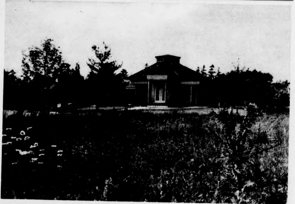
A field of weeds and a decaying sales pavilion, located to the south of the York graduate residences, are all that exist of Bramalea Corporation's ambitious Fountainhead project. The company's glossy brochures showed high-