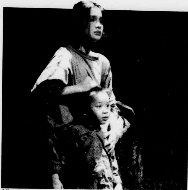
Miss Saigon comes to Toronto.

But, yeah. How about a bit of apocalypse—now (or reasonably then, like a fresh 30 years ago)—on stage, set to music reflecting the rhythms and inflections of a time closer to our own. Miss Saigon could very well tingle a few toes in a genuine manner, when it opens in 1993.