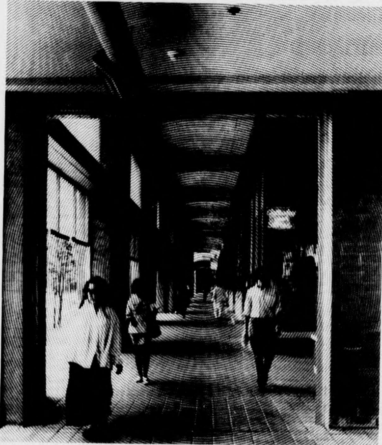
The guy who runs the university and the guy who runs the student centre both say they own this hallway

York paid a total of $6,500 in fines for the two charges.