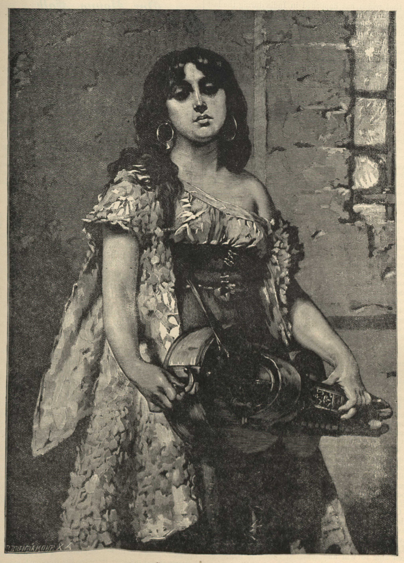
DALMATIAN GIRL, WITH MANDOLIN.