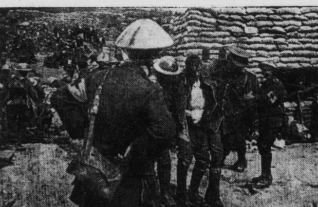
Wounded to the Trenches-Official Film, "Bottle of the So