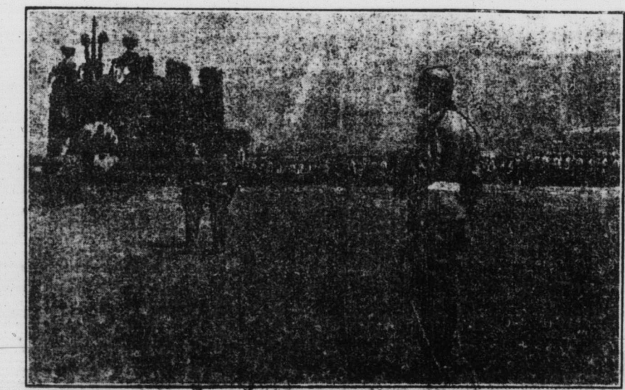
Serbian Troops Build Sanctuary in Honor of King Peter

the skin was too valuable to lose. In this manner he made his way through 75,000 to 350,000 tons annually. Milthe fast-falling night to his cabin. It was an unusual tale he had to tell his wife and children that evening round the supper table. At a depth of two thousand fath-at the control of two thousand fath-at the cape the pressure of the supper table. At a depth of two thousand fath-at the cape the pressure of the supper table. oms under the sea the pressure of are to be sent to Australia, 3,000 tons water is two tons to the square inch, to Hong-Kong, 15,000 tons to Canada, and the temperature is only just above freezing point.