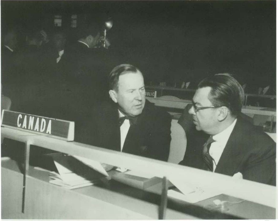
De gauche à droîte : L.B. Pearson s'entretient avec Paul Martin avant la réunion d'ouverture de la septième session de l'Assemblée générale des Nations unies.