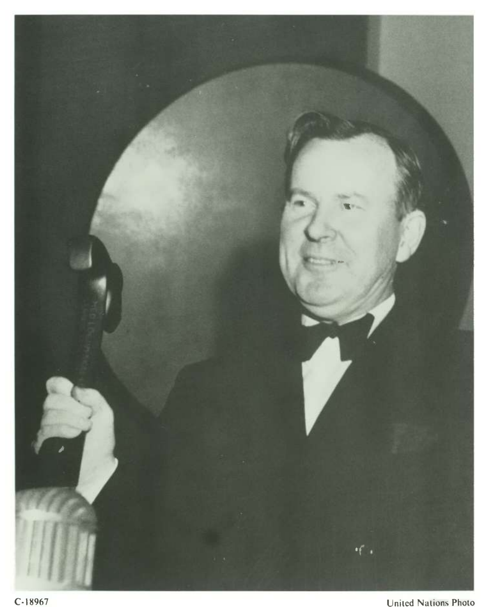
L.B. Pearson, en sa qualité de président, ouvre la septième session de l'Assemblée générale des Nations unies.