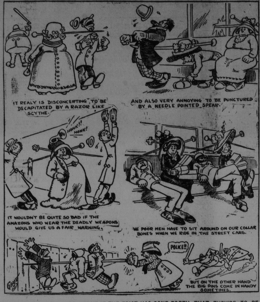
AND WHILE WE'RE TALKING ABOUT IT THE EDICT HAS GONE FORTH THAT THEY'RE TO BE LONGER.