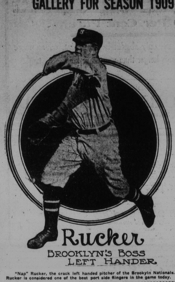
Rucker Brooklyn's Boss Left Handers

"Nap" Rucker, the crack left handed pitcher of the Brooklyn Nationals. Rucker is considered one of the best port side flingers in the game today.