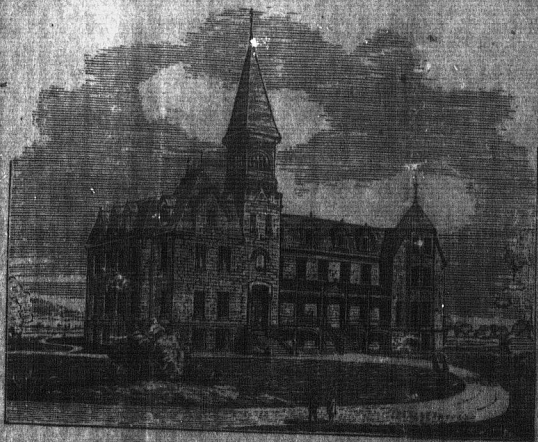
THE COUNTRY HOUSE ON THE MOLSON FARM.