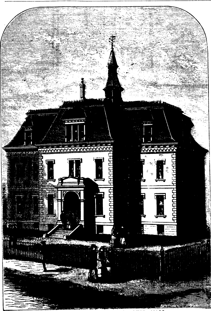
HIGH SCHOOL-HOUSE, DORCHESTER, MASS,

THIS beautiful struc. ture had been commenced and was well advanced in its construction when Dorchester became a part of the city, January, 1870, after which time the finishing and furnishing were carried out under the direction of the Committee on Public Buildings. The site of the building is at the corner of Dorchester Avenue and Centre Street. The structure is two stories high, exclusive of basement and attic. The walls of the superstructure are of brick faced externally with pressed bricks. The trimmings of the doors and windows, and also the angle quoins, are of Nova Scotia freestone. The basement is, externally, about five feet high above the ground,