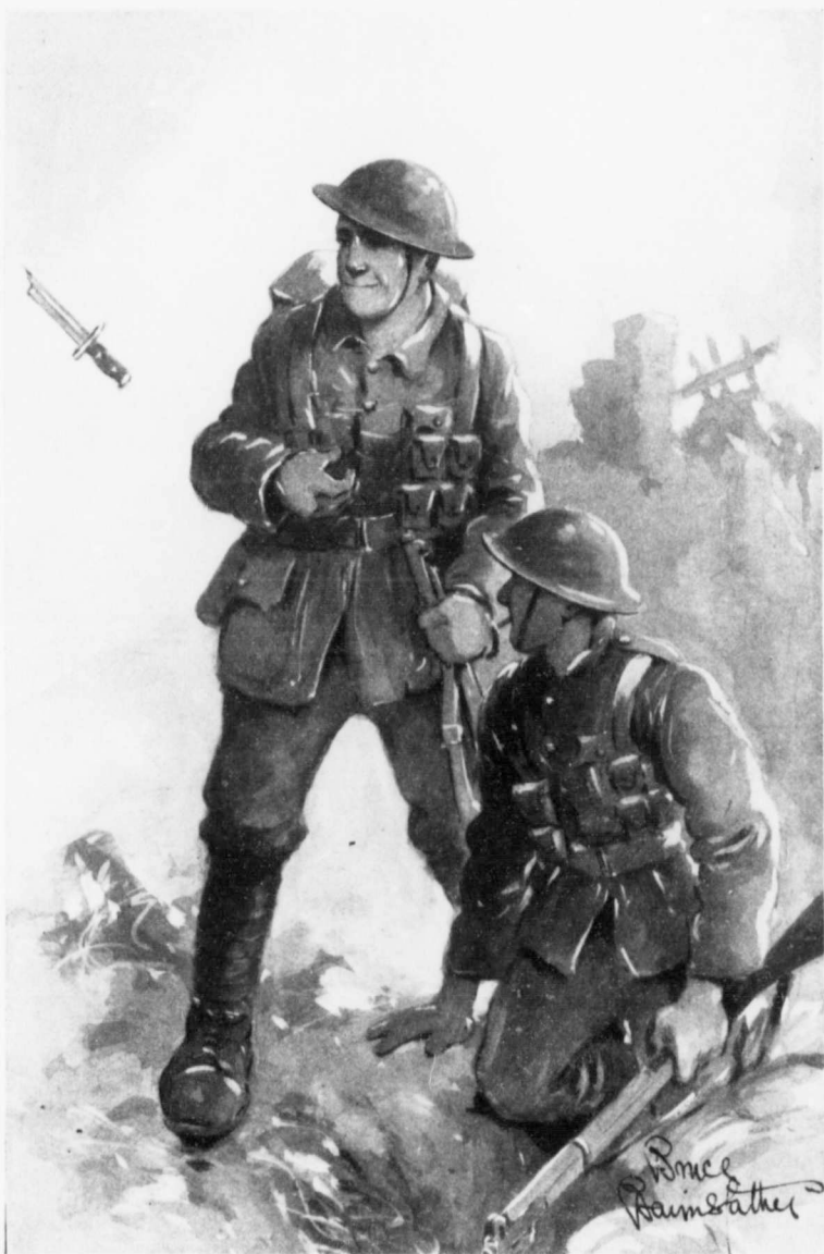
“Don't chuck that — thing away, 'Arry ; you'll want it in the next war.”

ER We de- ny — ise ise ch, of tys nd of n't of eir he 've nd in