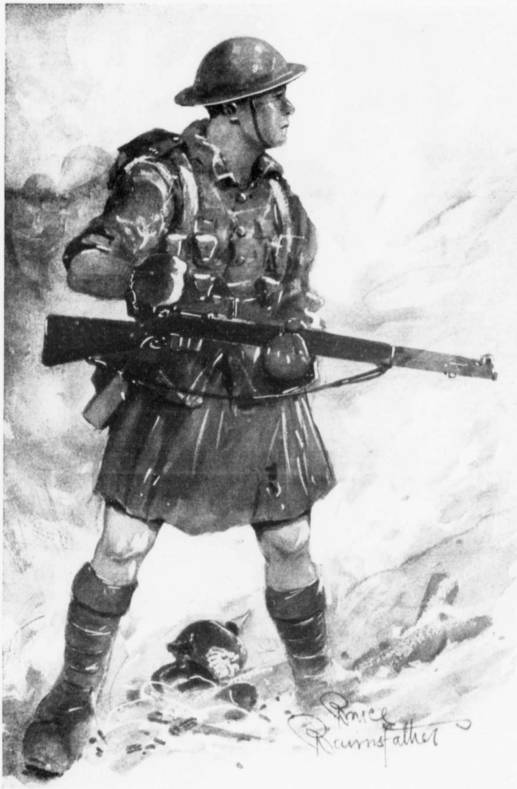
This determined forder of rivers, from north of Tweed to north of Ancre, has definite ideas about the Rhine.