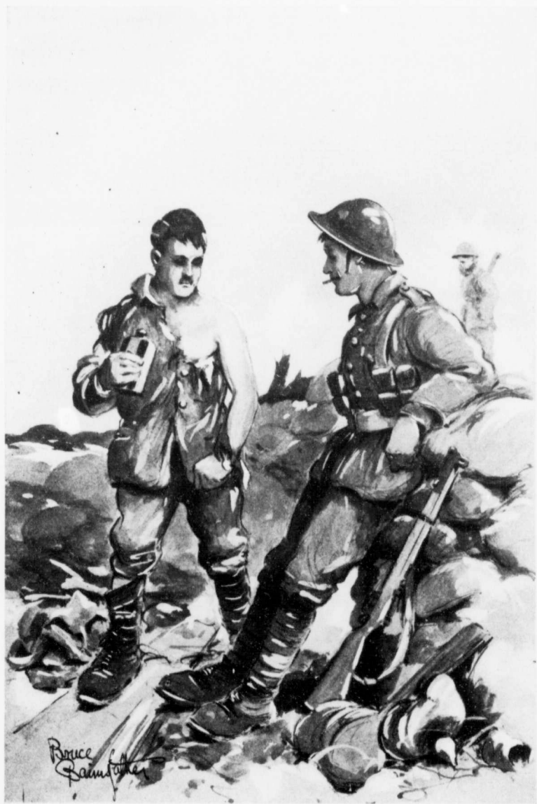
At the Second Line: "You'll 'ave to indent for a safety pin, me lad."