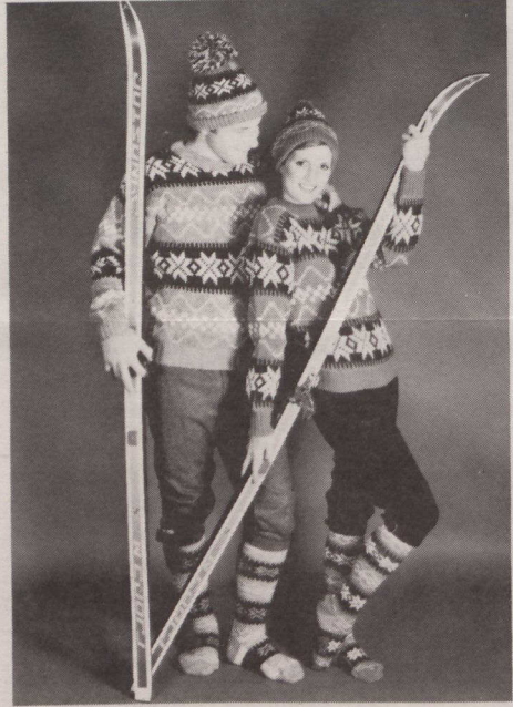
Kalpakian's "Brown Bison" collection is made from superior wool yarns and comes in every imaginable colour. Durable, fashionable and practical, they are ideally suited for both sports and leisure. The uniquely Canadian look is achieved through motifs and designs that symbolize the country's rich cultural traditions and wildlife.

The United States is the main export market for Canadian-made clothing ($147 million Cdn in 1982) and remains the most promising. Similarity of life styles and standards of living and the proximity to the US market give the Canadian clothing industry an advantage