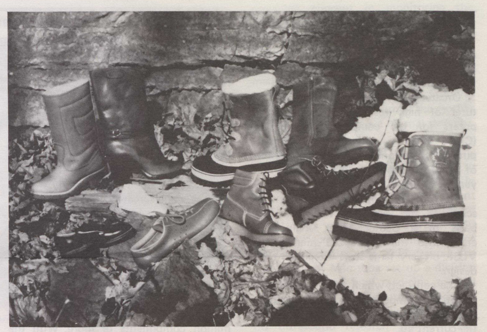
The Canadian footwear industry is well-known for its lines of traditional "fashion" footwear for ladies, men and children. Faced by frigid winters in the country, Canadians have gained special expertise in the production of boots and shoes for winter wear and are suppliers for these lines to buyers in many parts of the world.