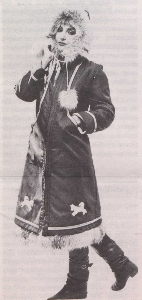
Princess Anne's entourage bought 15 Yukon parkas during their Yukon visit last June and the Queen is also reported to wear one sometimes. Actually two coats, the parka has a pure wool duffel interior with a wind and shower-proof outer shell.

Products most suitable for export potential are those where Canadian producers have established a quality image as well as design expertise, such as women's winter fashion boots, conventional and moulded ice-skates, moulded boots for roller skates, winter recreational and cold