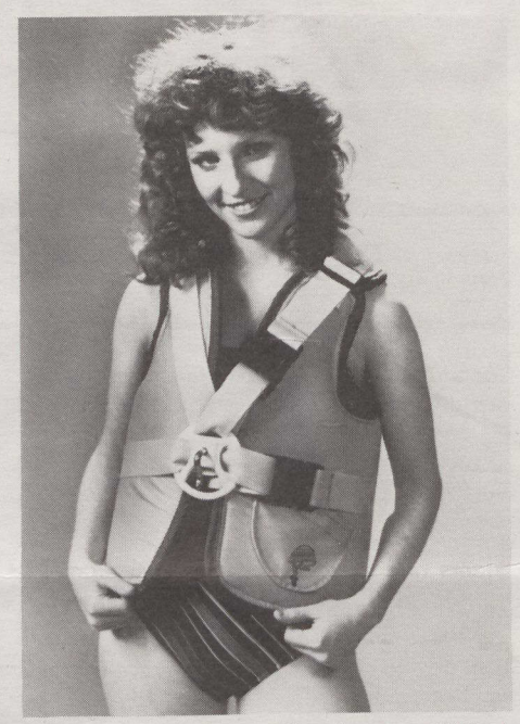
This unique, high quality harness "Windsurfing PFD" by Stan Louden Products Limited is being shown at the Snow Show in Las Vegas.

A stepped-up effort to increase the export volume of Canadian-made footwear is high on the list of priorities for the Department of Industry, Trade and Com-