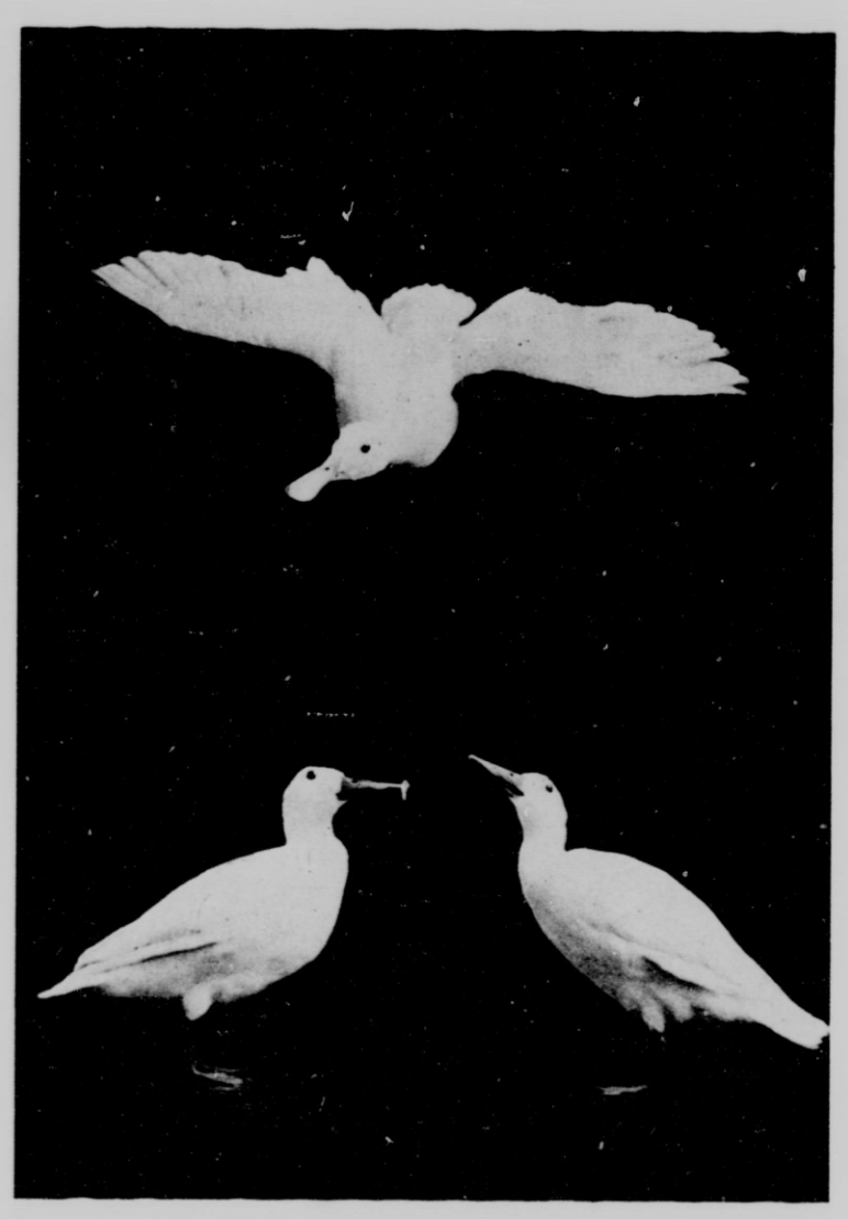
Three of a flock of five albino Shovellers taken Sept. 3rd, 1904, by ALEX. CALDER, 50 miles S. W. of Calgary, Alta.