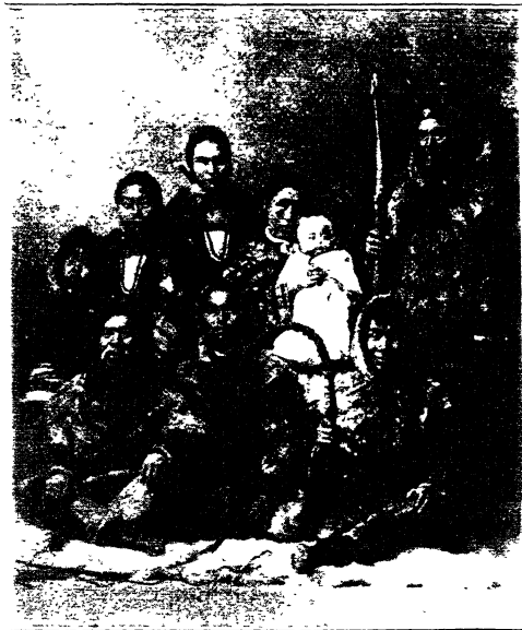
— Represents a Group of Eskimoes in their Winter Clothing