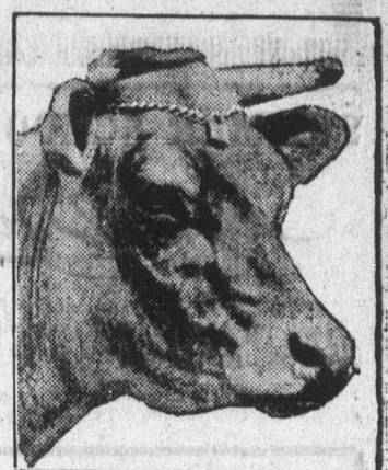
More Dairy Cows Are Needed.

Stockyard market demand for milch cows and the fact that big runs of calves have failed to bring runs of calves have failed to bring the veal price down, seems to indicate good prospects for the dairy business, and the fact that the producers of the Toronto milk supply were able to accept a lower price than was thought possible a month ago, is a further indication. Considering the season of the year, the milk flow is very satisfactory, and should allow of a record make of cheese and butter. On the other hand there is but little demand for stockers and feeders despite the good prices ruling of later for finished beef, the feed price being yet too good prices ruling of later for finished beef, the feed price being yet too high to allow of carrying extra animals over. Farmers are hanging on to their sheer, however, the supply of this stock offered for many weeks past being smaller than usual even at this time of year, and such as to indicate that it is not all due to the existence of the lambing season and shearing activities. Hog prices are steadily improving despite threats of a cut which are made weekly, but of a cut which are made weekly, but fail to amount to very much. This fail to amount to very much.