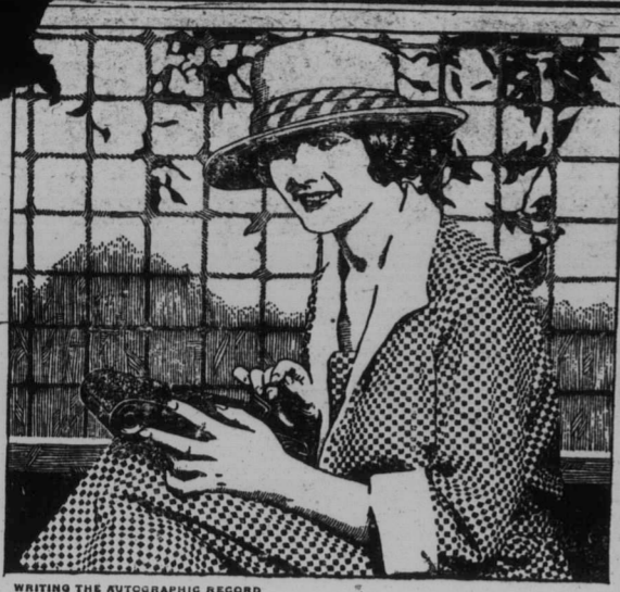
WRITING THE AUTOGRAPHIC RECORD