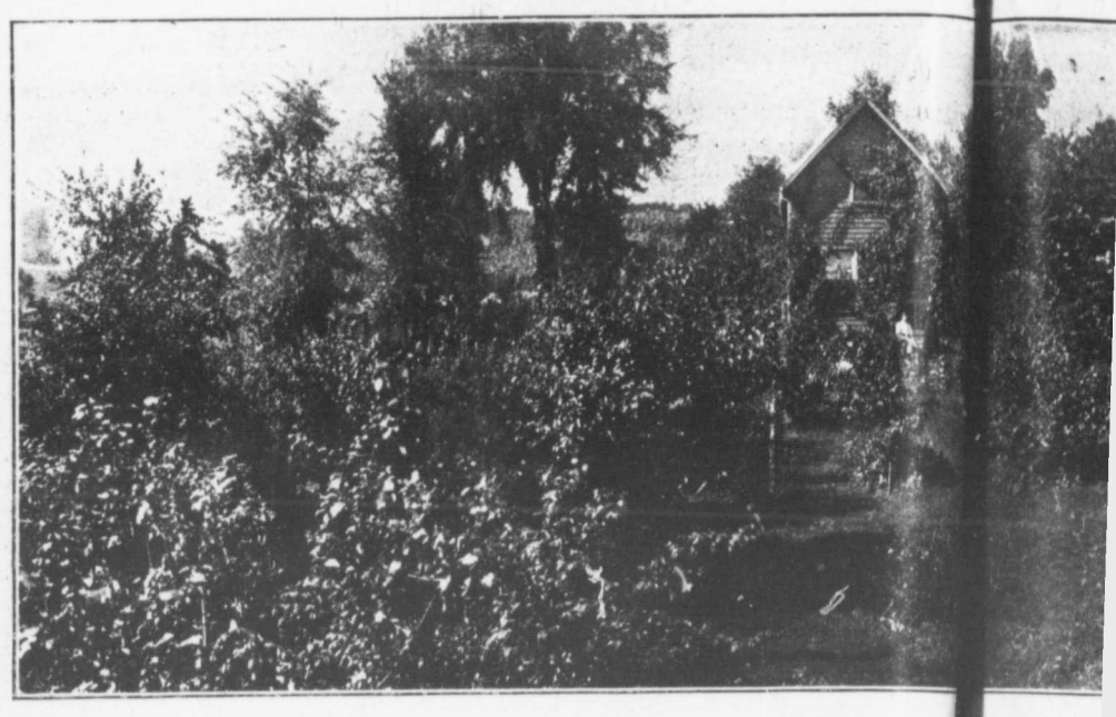
GATINEAU VALLET wyn, Showin

had not these advantages. Each had to search out the best method for himself, and many in their experimenting paid dearly for the lessons learned; while row, by the improved hives and by being able to control the swarming, the young man in the business to-day can handle more than four times the amount of bees with less labor than he could have done in past years. Many of us know that the bee-keeping business is just in its infancy, owing to the rapid increase in the demand for honey. Never until the past few years has either the Government or the general public recognized what an important business bee-keeping is beginning to be throughout our country. Especially the Government is waking up to the fact that bee-keeping is one of the most promising industries of the future, and worthy of its aid in stamping out all bee diseases. The young man, under the new methods, will not now be so easily