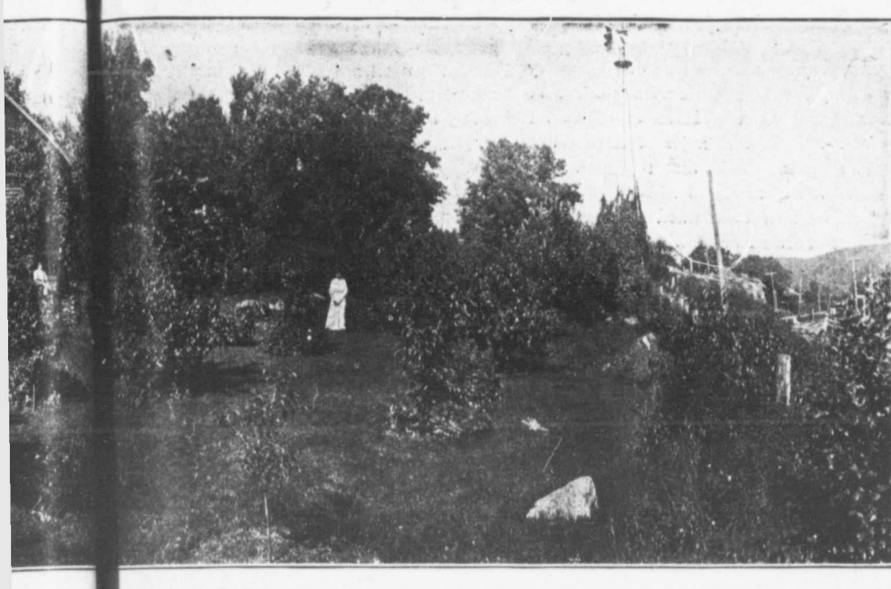
U VALLEY wyn, Showing Cellar.

build up a great deal faster in the spring but will than the older queens. We must also ng several raise our queens from the test stock we t that the have in our yards, and occasionally add it remains and have some new blood, which is very important. I will here give a few facts as to results e are runobtained by fall feeding in my yard of must have 320 colonies during the fall of 1909. On ree supers the 1st of October 280 colonies contained ktract any from 15 to 30 pounds of honey in the been well brood chamber, and were each fed 20 etting our pounds of sugar syrup, mixed two pounds Il not only of sugar to one of water; and 20 colonies will soon that had practically no honey were fed same, and about 30 pounds, while the remaining 20 more, and had plenty of natural stores and were not e a larger ve will also fed any syrup. Now the results were f the main that all but one stock came through the winter alive, and apparently one seemed of honey is as strong as the other when removed rong condiflow starts. from the cellar, but at the beginning of w from my the honey flow 90 per cent. of those that had both honey and syrup were boiling neens raised ly all cases over with bees and needed supers, while