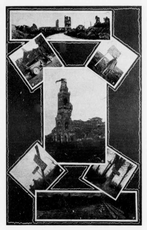
What is left of the Cloth Hall, Ypres Railway Station, Arras The Battalion Padre

oth Hall, Ypres 4. The Cathedral, Albert 5. Villers Carbonnel 6. Along the Roye Road 7. "B 4" to Passchendaele