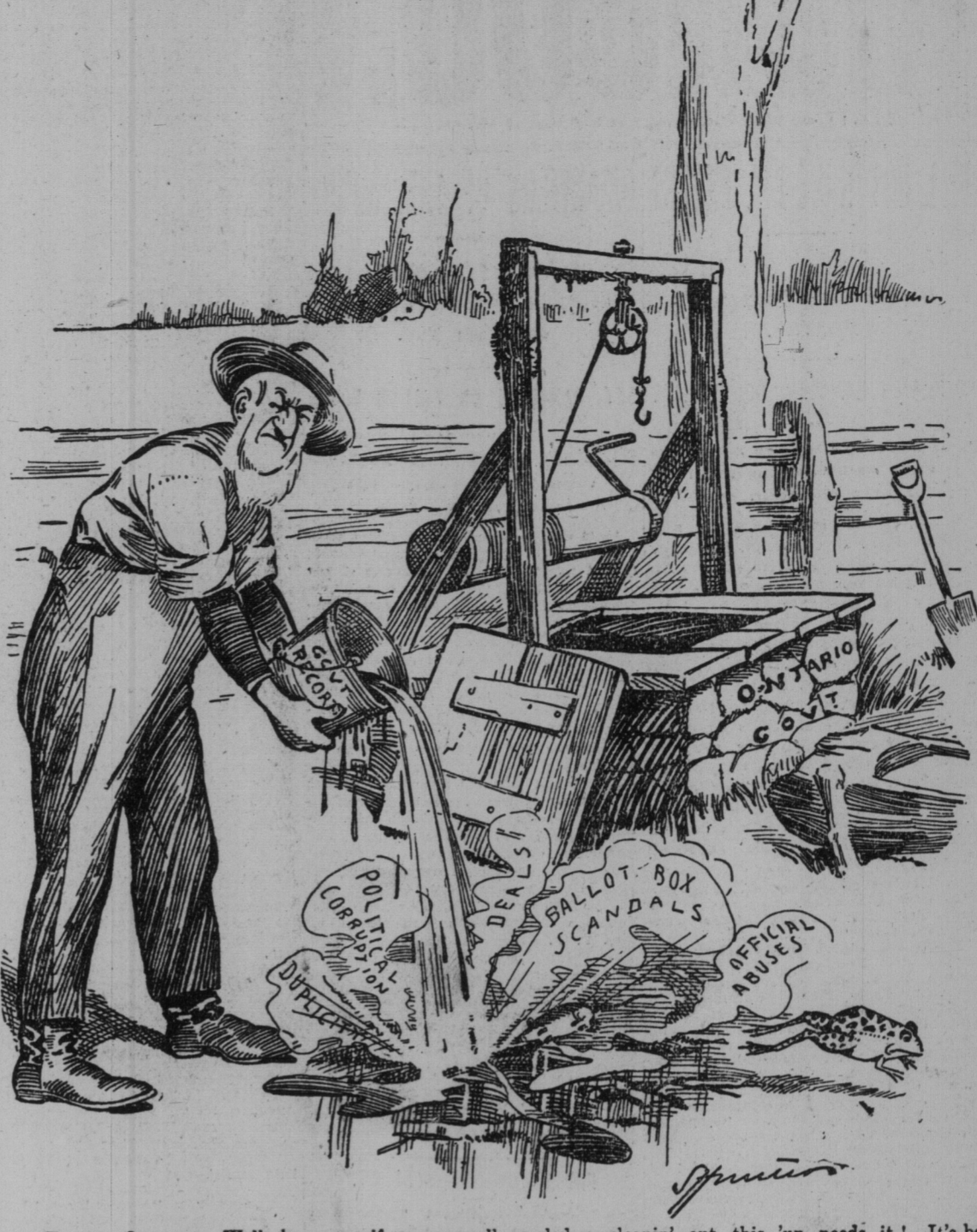
FARMER ONTARIO: Well, by gum, if ever a well needed a cleaning' out this 'un needs it! It's ben accumulat' things for thirty years.