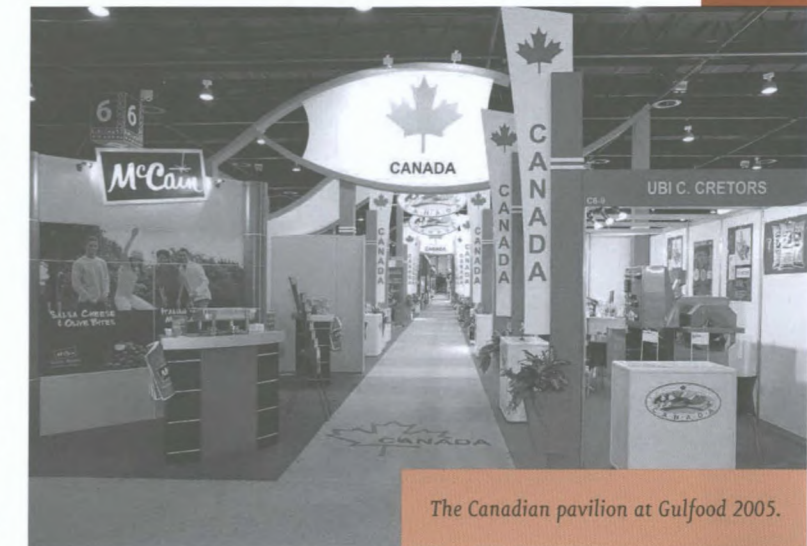
The Canadian pavilion at Gulfood 2005.

booth in the Canada pavilions is $6,300. All booth reservations must be made by December 2, 2005, and will be allocated on a first-come, first-served basis.