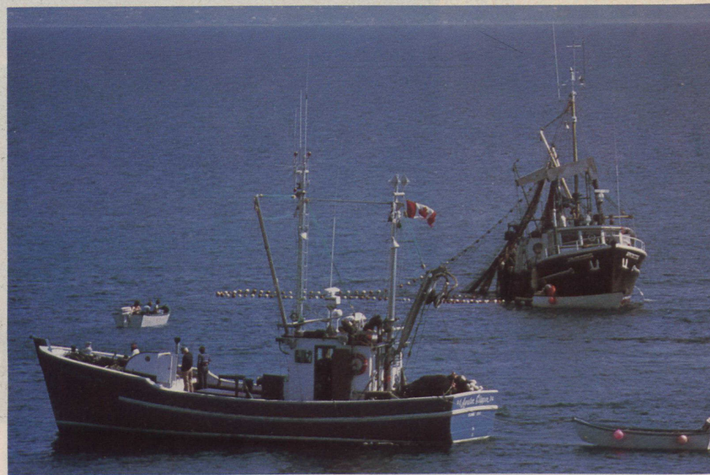
Mackerel fishing off Canada's east coast.