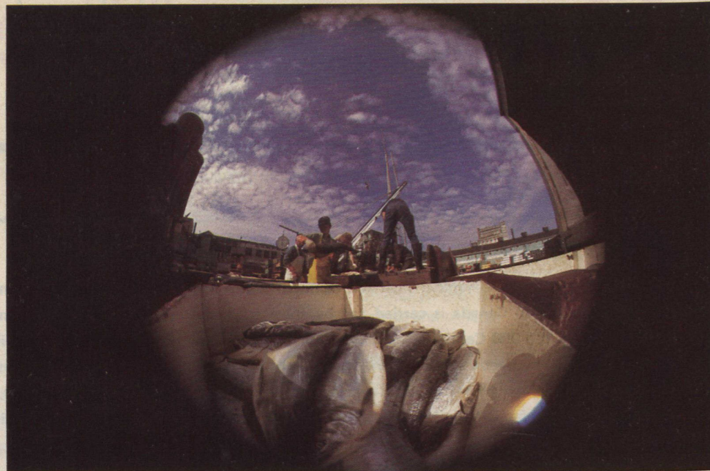
Fish is weighed as it is taken from the boat.

In 1982, over-all landings for the inland fishery showed an increase from 49 956 tonnes in 1981 to about 57 900 tonnes. The landed value is estimated to be $64