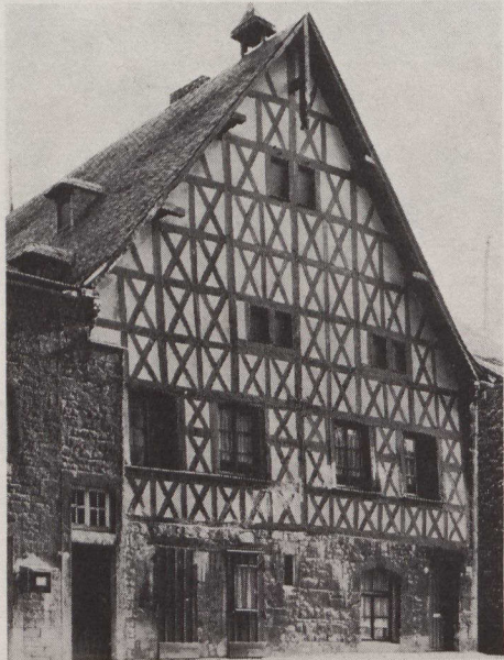
Half-timbering techniques originated in Europe 400 years ago. Carpenters relocating to North America brought their skills in timber-frame construction with them.

In many ways, it is impossible to distinguish between today's masonry and timber-frame houses. This is because the identical exterior cladding is used in both types of construction.