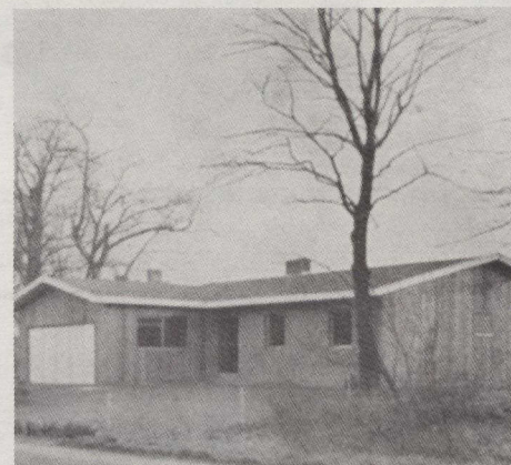
Timber-frame construction has been proved to be both cost effective and energy efficient.

In that period, masonry construction methods spread. Although a variety of factors contributed to the popularity of this technique, including the shortage