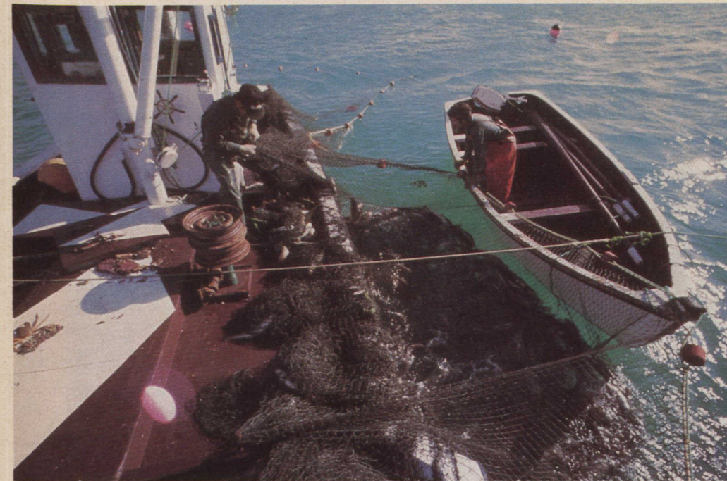
Hauling in cod.