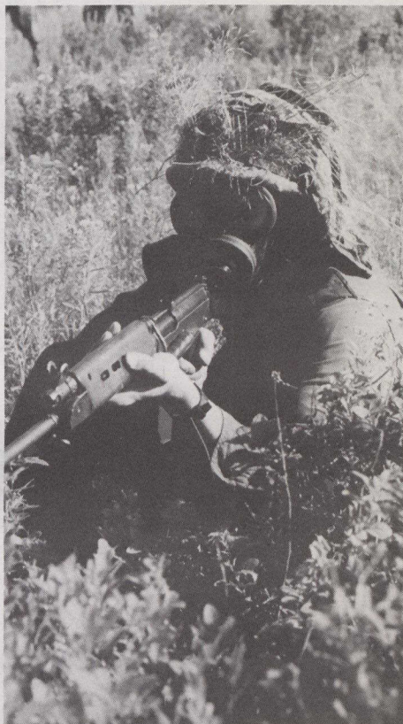
Soldier in combat training exercise at Camp Gagetown, New Brunswick.

The first episode of the series, The Road to Total War , was shot in Europe and