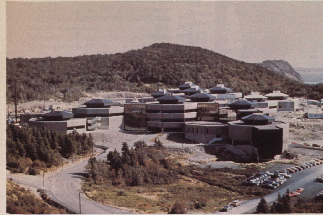
The Northwest Atlantic Fisheries Centre, St. John's, Newfoundland.