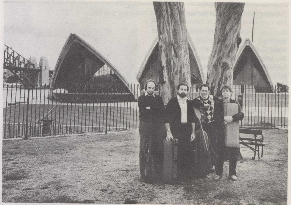
Canada's Orford String Quartet recently completed a successful tour of the Far East, giving concerts in Australia, New Zealand, Hong Kong and Japan. (Above) members of the Quartet in front of the Sydney Opera House during their stay in Australia.

The latest census shows that 62 per cent of dwellings in Canada in 1981 were owned by the occupants, a 2 per cent increase from the decade earlier. Ownership ranges widely, from 81 per cent in