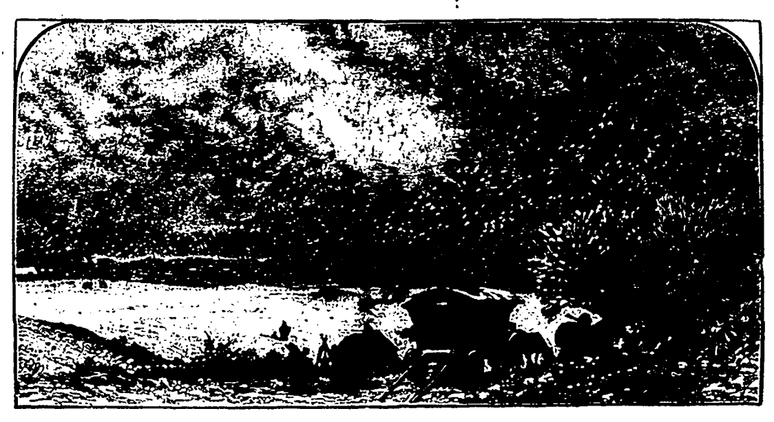
A GIPSY WAGON.