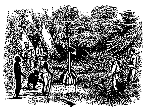
LIVINGSTONE AT BISHOP MACKENZIE'S GRAVE.