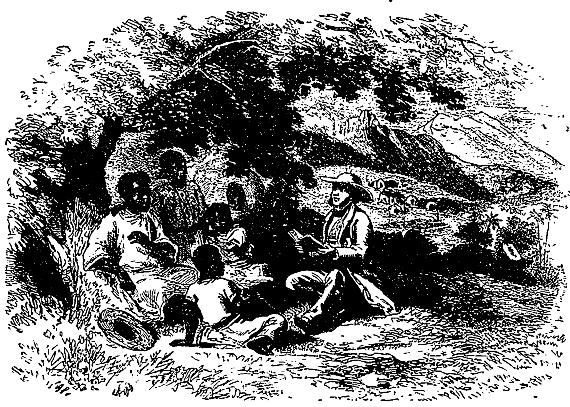
THE AFRICAN MISSIONARY.

establishing some new and lawful commerce, as the surest 'ay of undermining the slave trade. This is the view of statesmen to-day, who are insisting on the formation of railway lines into the interior, as the only means by which the traffic can be really stamped out.