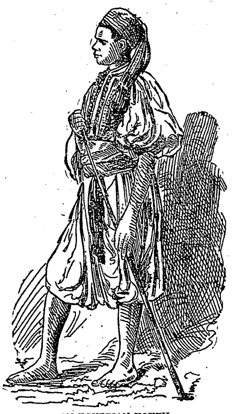
AN EGYPTIAN YOUTH.

The boys go to school when quite young, but their schoolrooms are a great contrast to those of other countries. We entered one