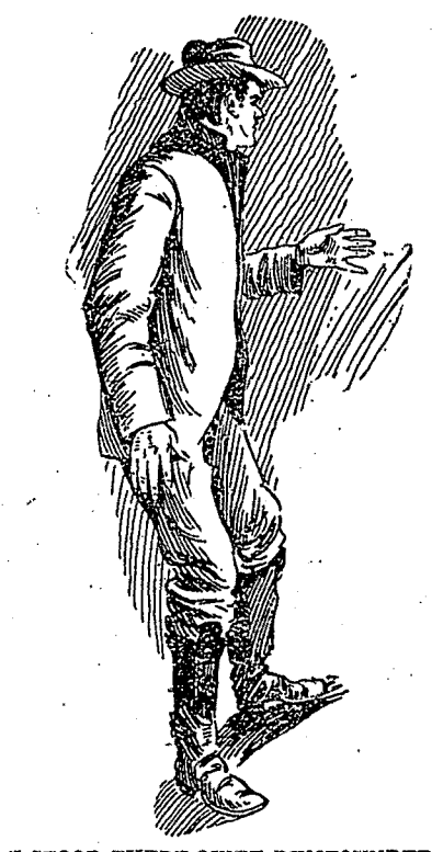
'I STOOD THERE, QUITE DUMFOUNDED.

Now I battened my camp thickly with cedar and fir boughs, prepared a great pile of fire-wood by chopping up one of the log camps, and entered upon the winter comfortably. In that great ravine, hedged about