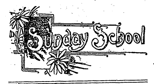
LESSON XII.-JUNE 23.