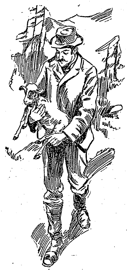
'I CARRIDD THE FORLORN LITTLE BEAST TO MY CAMP.'

Although I was gone for but ten or fifteen minutes, I found so much water rushing under and even over the bridge when I returned that I dared not cross to the camp again. Even while I stood looking at it in dismay, the whole pent-up flood broke loose