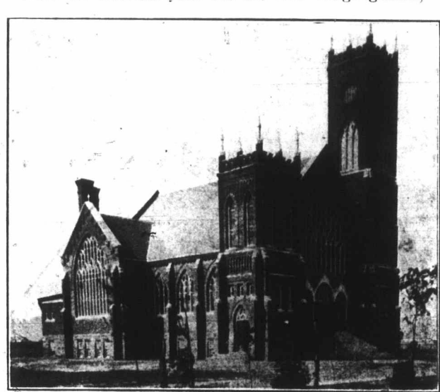
St. Paul's Church, Fort William.

Fort William.—St. Paul's.—The year 1908 has been an eventful year for the new congregation,