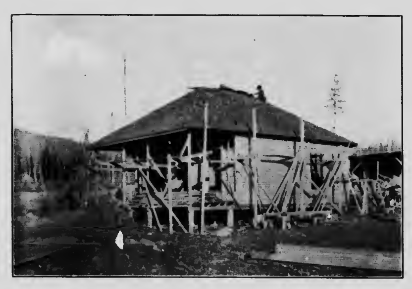
COTTAGE IN COURSE OF CONSTRUCTION BY THE WESTERN CORPORATION, LD.