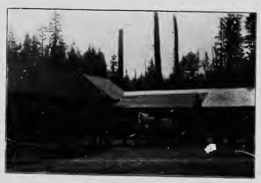
WESTERN CORPORATION TEAMS BRINGING IN LOGS TO THE MILL