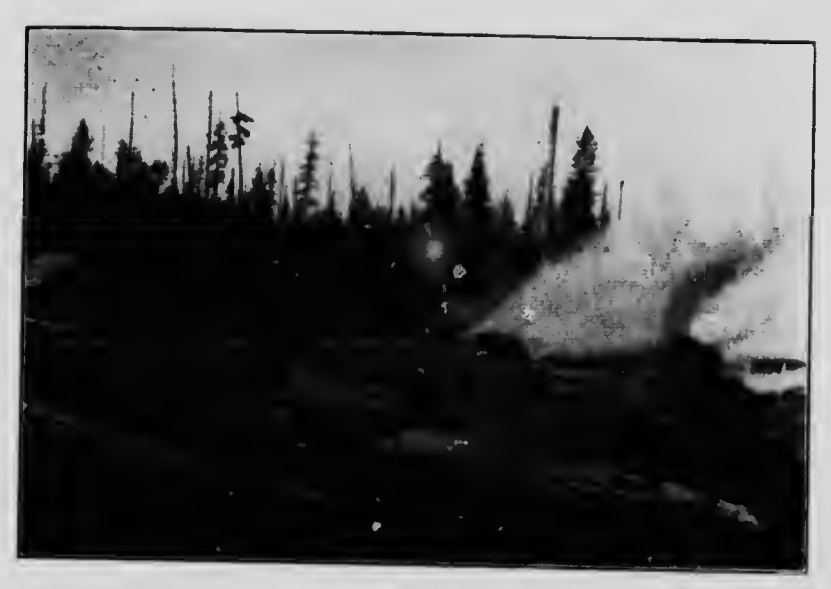
GENERAL VIEW OF THE MILL SITE OF THE WESTERN CORPORATION, LD. SEVENTEENTH STREET, NORTH VANCOUVER, B. C.