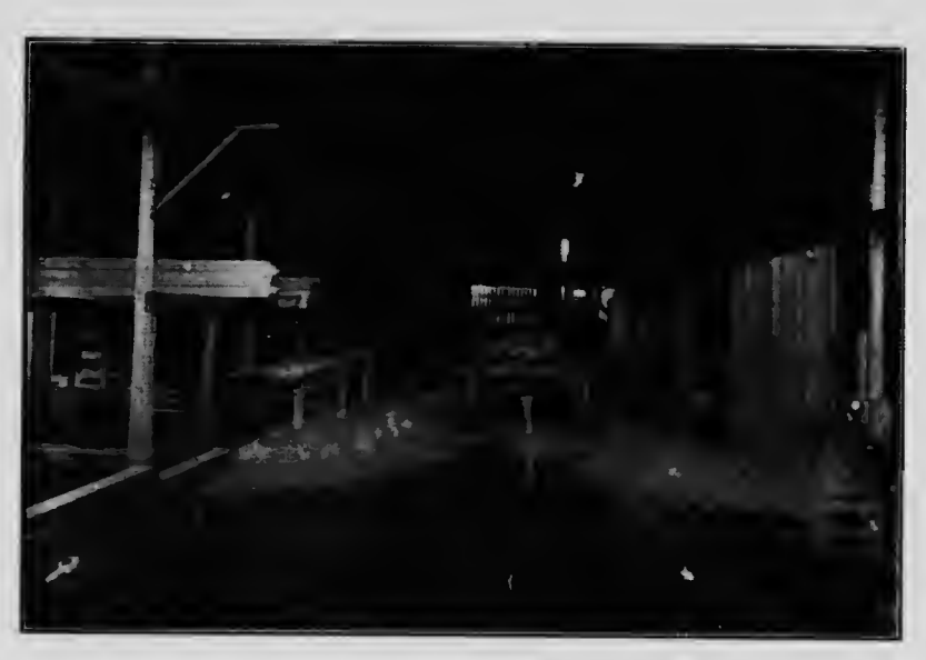
SHIPPING OUT FINISHING LUMBER FROM THE WAREHOUSE OF THE WESTERN CORPORATION, U.D., LONSDALE AVENUE, NORTH VANCOUVER