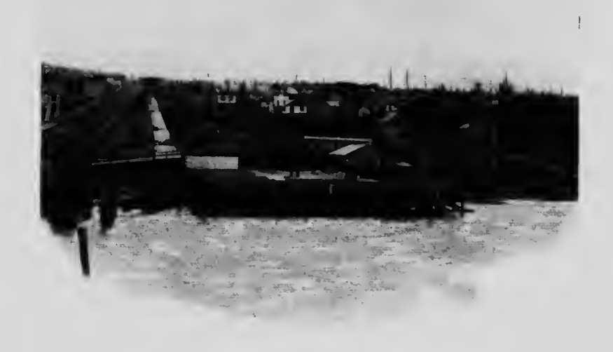
WESTERN CORPORATION WHARF NORTH VANCOUVER, B. C.