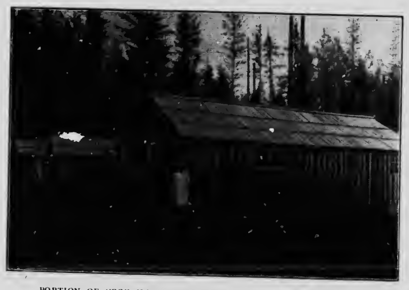
PORTION OF COOK HOUSE AND BUNK HOUSES OF THE WESTERN CORPORATION, LD.