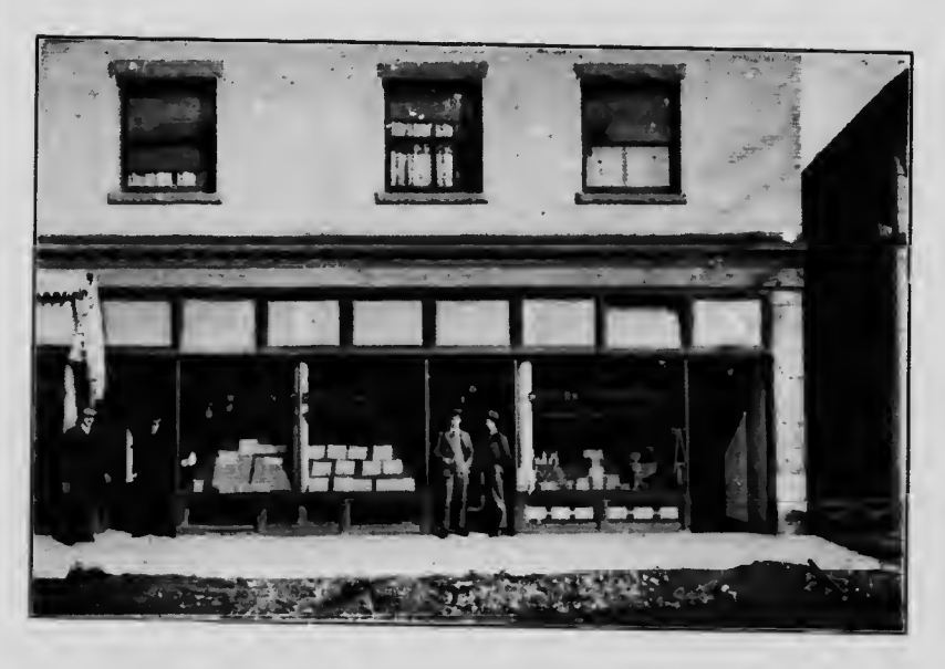
HEAD OFFICE OF THE WESTERN CORPORATION, LTD.