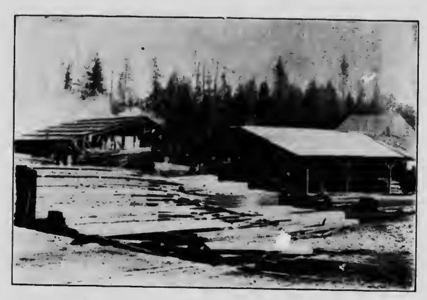
PORTION OF SAW MILL AND LUMBER VARD OF THE WESTERN CORPORATION SEVENTEENTH STREET, NORTH VANCOUVER, B. C.