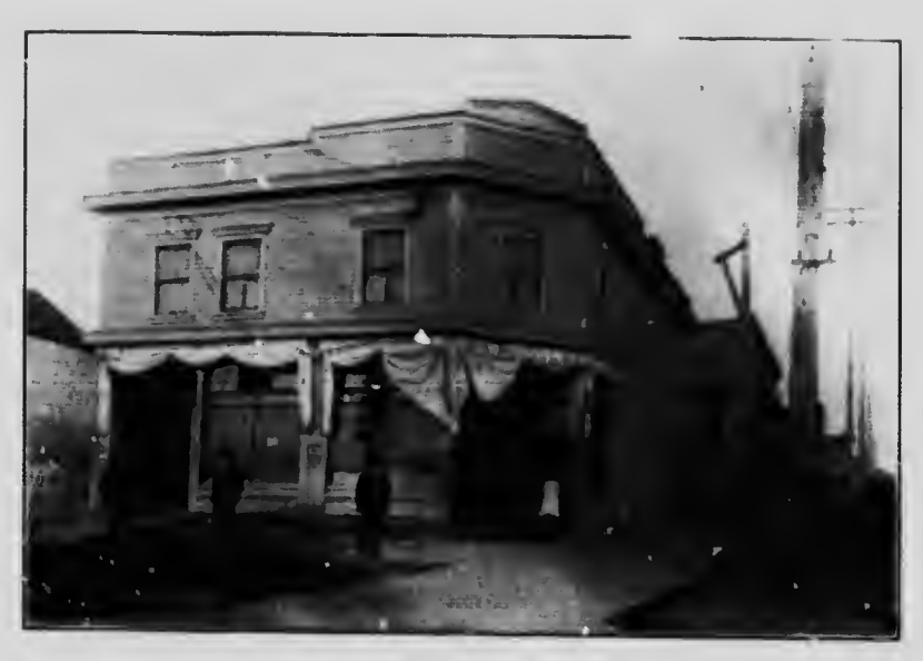
THE FIRST BUSINESS BLOCK IN NORTH VANCOUVER ERECTED BY THE WESTERN CORPORATION, LD.