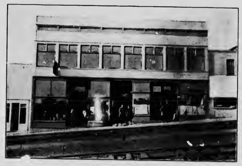
"THOMPSON BLOCK," NORTH VANCOUVER, B. C. DESIGNED BY PALTON & EVELEIGH BUILT BY THE WESTERN CORPORATION, LD.