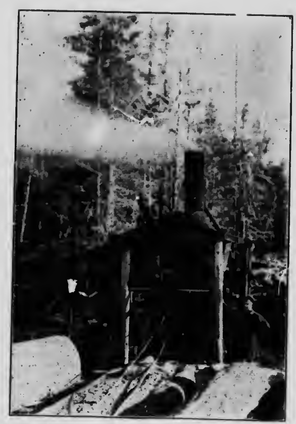
DONKEY ENGINE OF THE WESTERN CORPORATION HAULING LOGS TO THE MILL