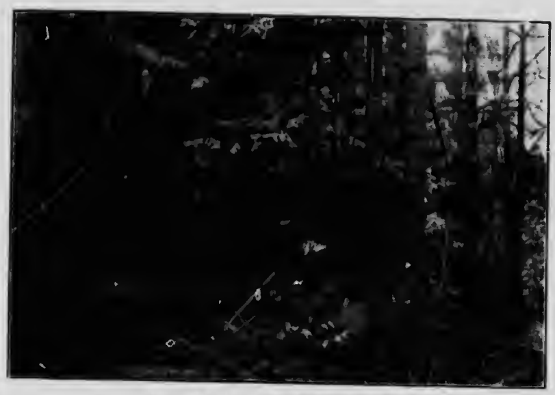
ASPECT OF FOREST BEFORE MAKING A ROAD