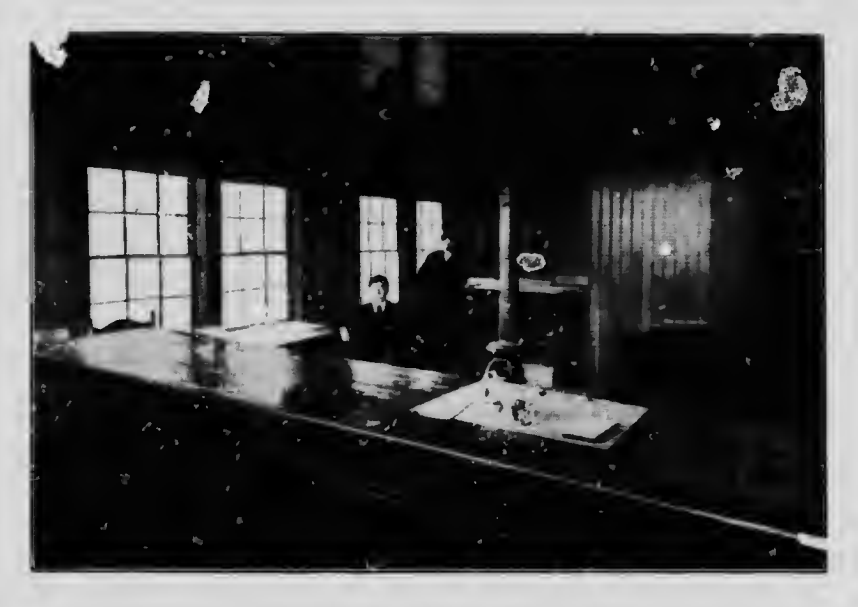
INTERIOR OF THE WESTERN CORPORATION ARCHITECT'S OFFICE NORTH VANCOUVER