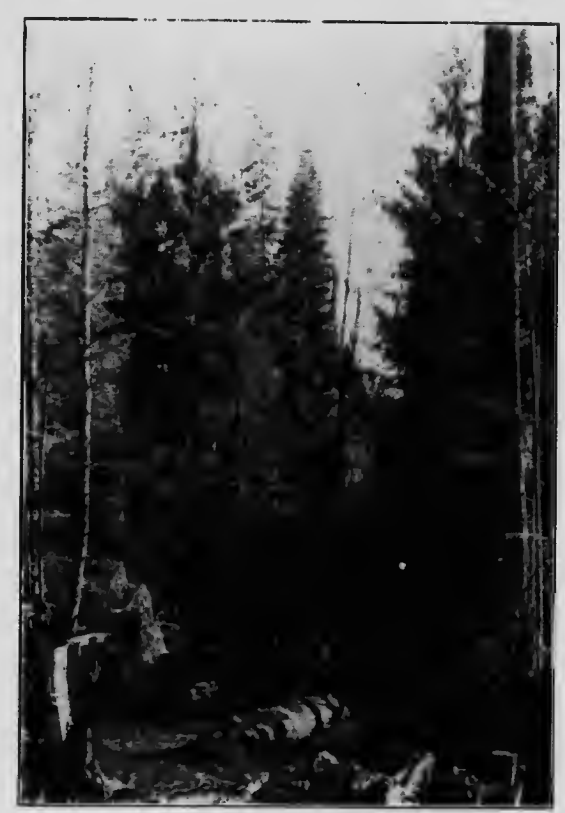
ROAD PARTLY MADE THE UNDERBRUSH HAS BEEN OUT, READY FOR THE DONKEY ENGINE TO PULL OUT THE STUMPS