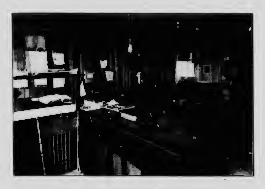
INTERIOR OF THE WESTERN CORPORATION GENERAL OFFICE IN NORTH VANCOUVER