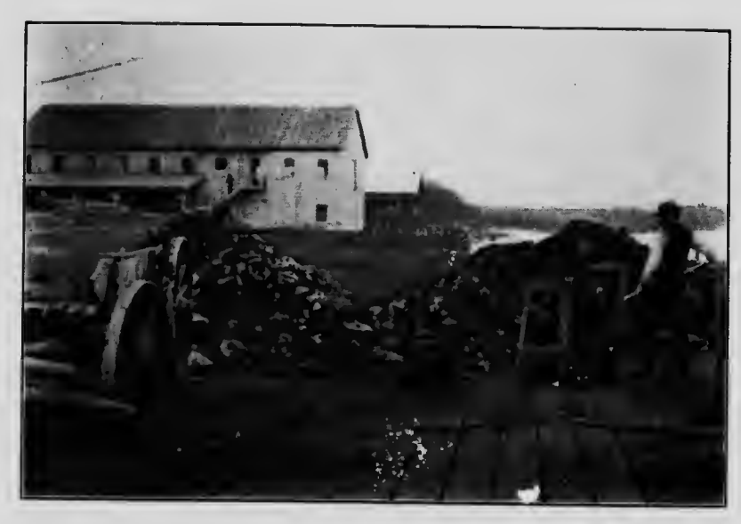
SHIPPING OUT COAL FROM THE COAL BUNKERS OF THE WESTERN CORPORATION, LD.