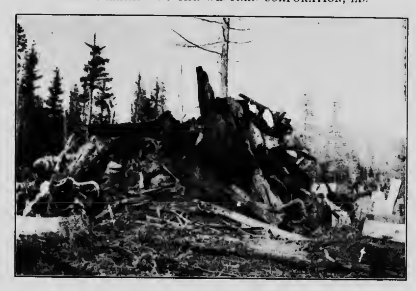
STUMPS AND TREES PILED UP BY THE DONKEY ENGINE READY TO BURN