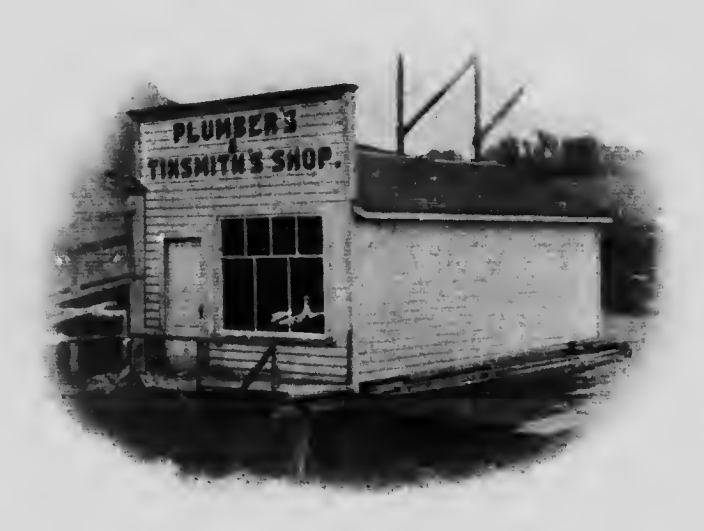
WESTERN CORPORATION PLUMBER'S SHOP