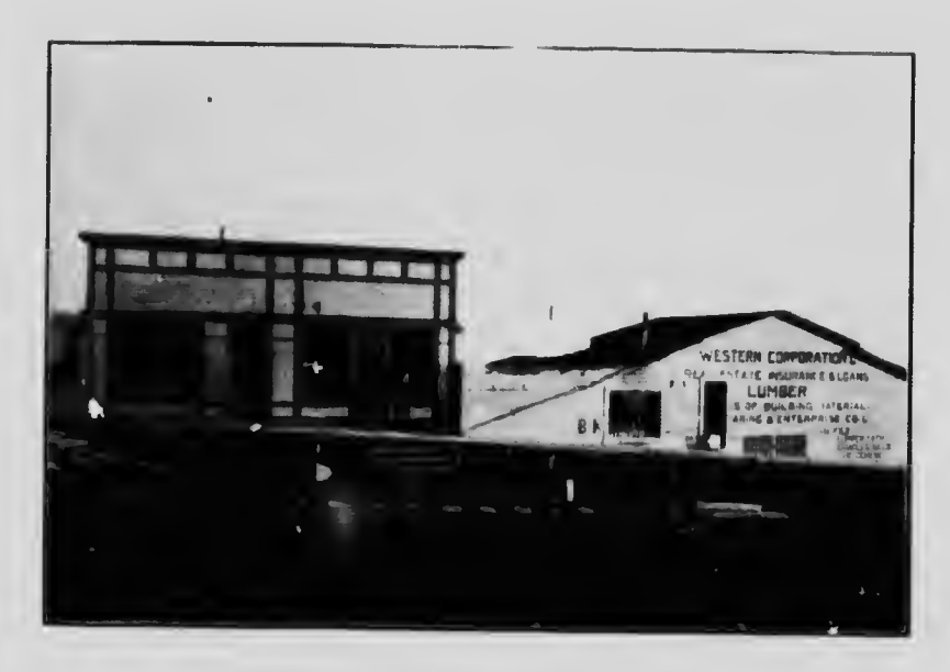
OFFICES OF THE WESTERN CORPORATION, LID. LONSDALB AVENUE, NORTH VANCOUVER, B. C.