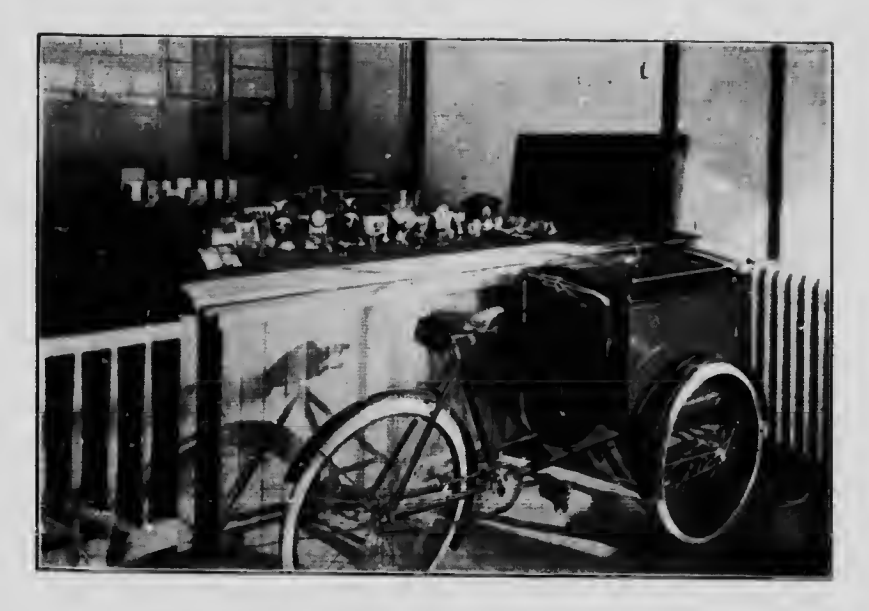
INTERIOR VIEW OF PORTION OF THE WESTERN "MANUFACTURERS' AGENCY" DEPA