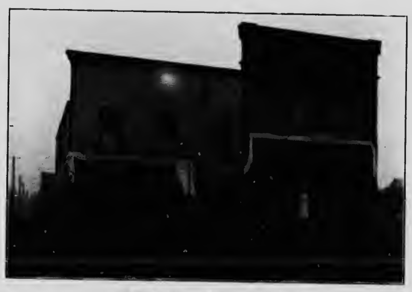
"BEASLEY BLOCK," NORTH VANCOUVER, B C. DESIGNED AND BUILT BY THE WESTERN CORPORATION, LD.