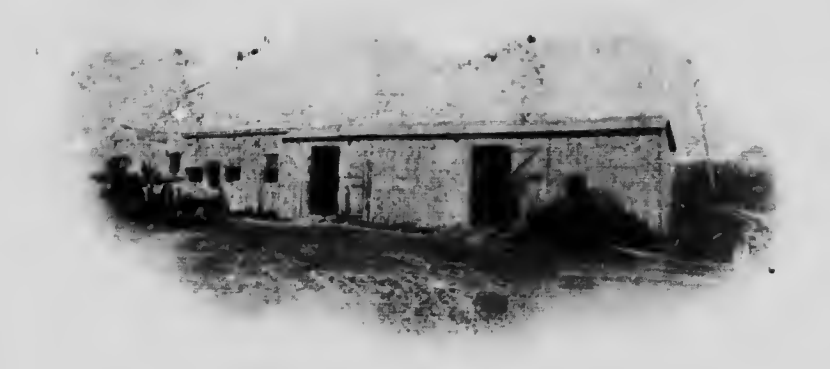
ONE OF THE STABLES OF THE WESTERN CORPORATION, ED.