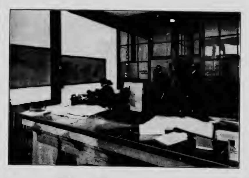
OFFICES OF THE WESTERN CORPORATION, LTD. PENDER STREET, VANCOUVER, B. C.