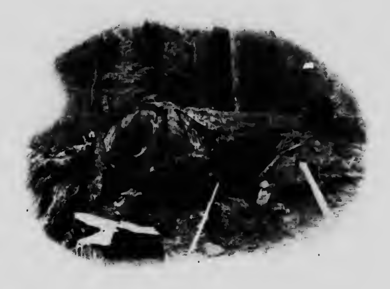
VIRGIN SOIL, WHERE SPLENDID FRUIT IS GROWN AFTER THE LAND IS CLEARED OF STUMPS, TREES, ETC.