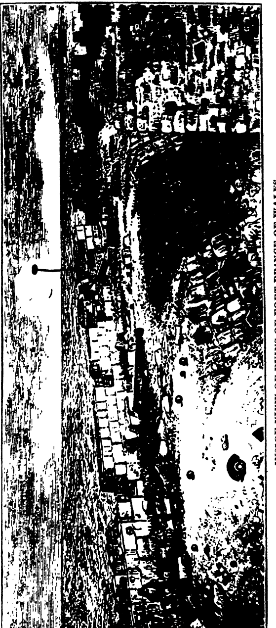
INSIDE VIEW OF RUINS OF FORT PRINCE OF WALES, Churchill Harbour.