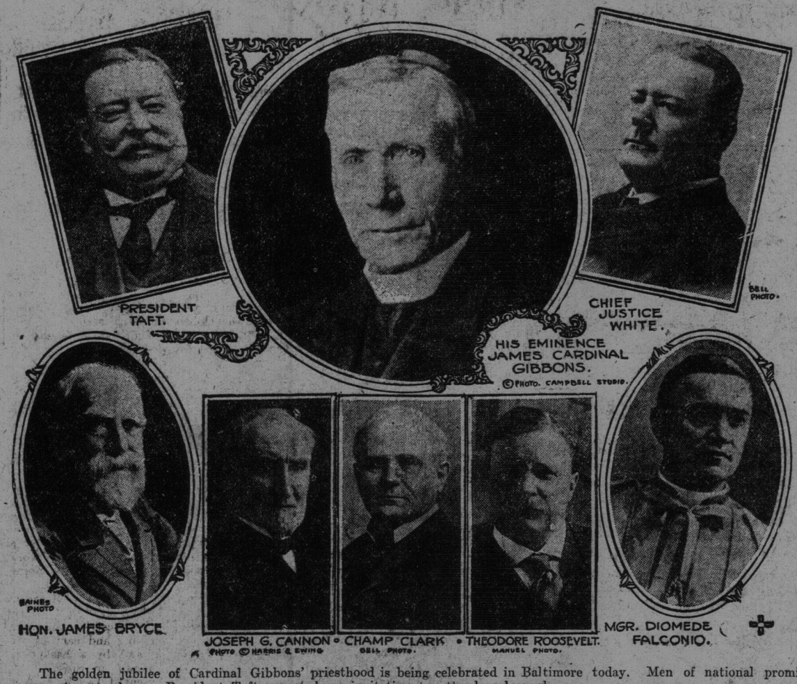
The golden jubilee of Cardinal Gibbons' priesthood is being celebrated in Baltimore today.