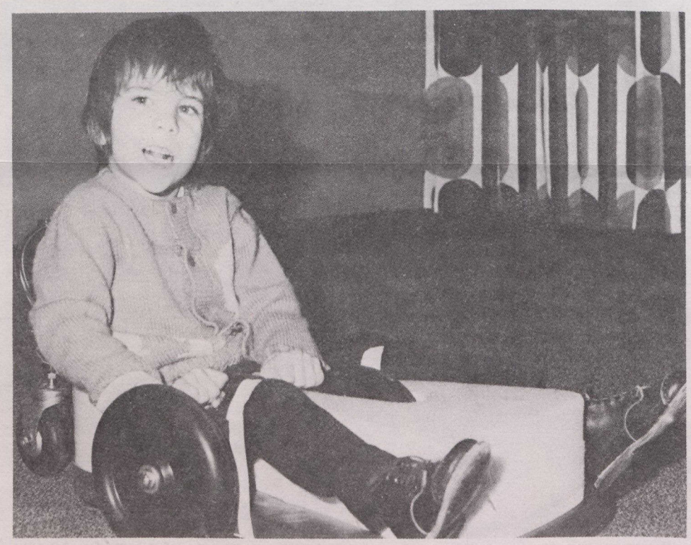
Children can easily propel the Caster Cart (resembling the Big Wheel) with their hands by pushing on the large wheels, and it is directed into a turning position by the swivel caster.

Children with learning disabilities (it is estimated that from five to 20 per cent of Canada's student population has some (Continued on P. 8)