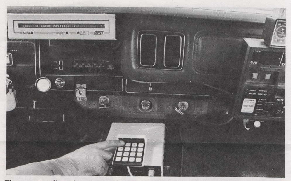
The computer dispatch system can handle 10,000 calls a day.

The entire cycle, from customer callin to cab dispatch, takes only seconds compared to two to four minutes under conventional means. A beeper alerts the driver to a new message on his screen and he has 30 seconds to acknowledge the call. If no response is given, the call is