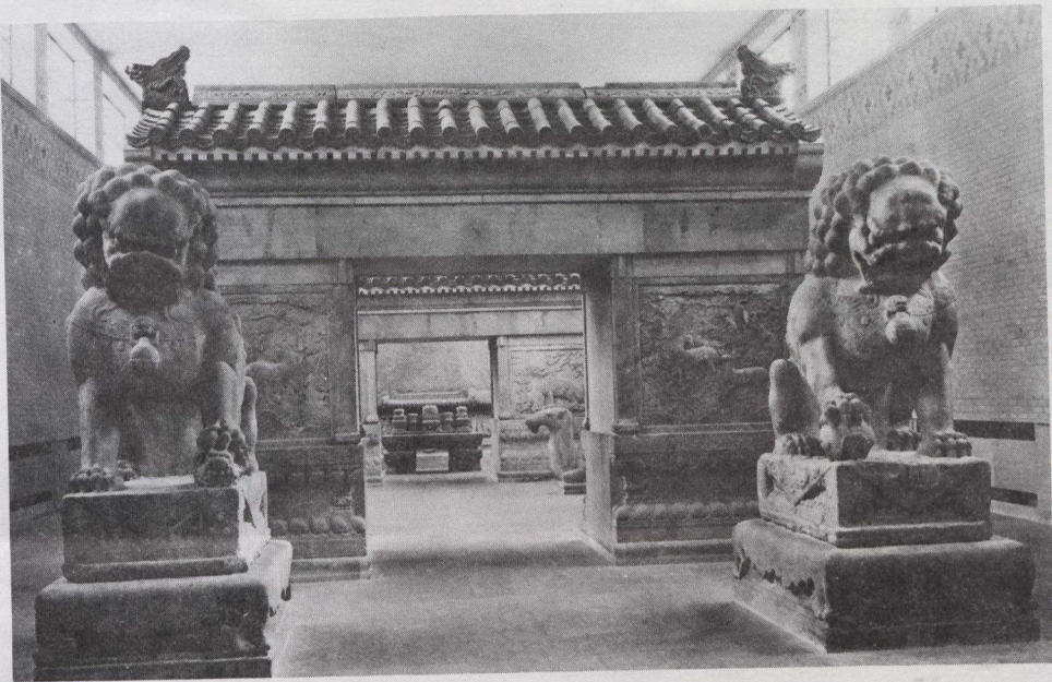
The Ming tomb prior to its relocation in ROM's Chinese Garden in 1959.

Included in the move is the museum's enormous Chinese collection. During construction a type of "bomb shelter" will be built around the Monastery of Joyful Transformation's huge wall mural, which