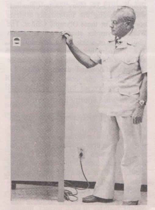
Uneven, uncomfortable temperatures are no longer problems when the Quanta 410 is installed in the work area (above).

The Quanta 410 operates at optimum efficiency and therefore uses less fuel to keep areas at comfortable temperatures. In addition, less energy is lost through ceilings and upper walls.