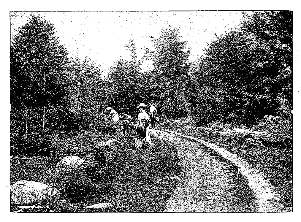
BERRY PICKING .- R. S. CLARKE.

E re-produce this month three pictures from negatives made by Toronto camerists. As to being good pictures, they speak for themselves; as to artistic work with the camera, they have decided merit, and show that besides having a thorough knowledge of the many different and difficult processes that enter into the make-up of a successful photographic picture after the exposure is made, that many who use the camera possess the "artist's eye" which sees a picture in the unconscious posing of a ragged urchin, or perceives the beautiful setting nature has given some moss-covered rock or leafless tree.