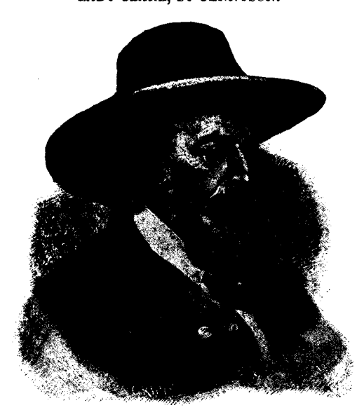
ALFRED, LORD TENNYSON:

ENTRANCE LITERATURE. LADY CLARE, BY TENNYSON.