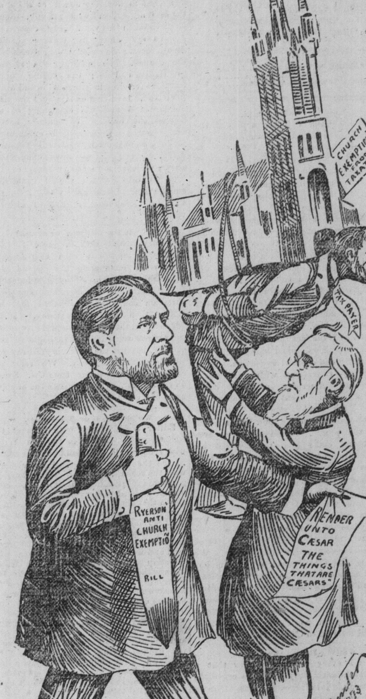
REVENUE TO CEASAR THE TITLES OF THE CEASARS

At the meeting of the Collegiate Board last night the estimates for the year were submitted. They aggregated $63,300. Of this amount it is estimated $16,300 will come from the city treasury.