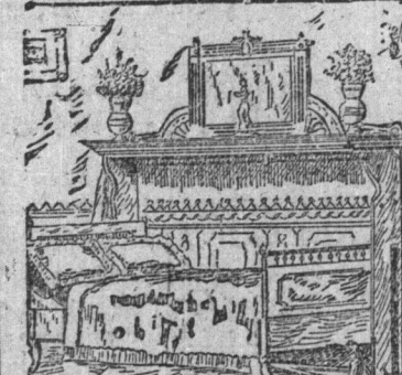
MARTEL FOLDING BED Best on earth. $18 Cash or Credit.