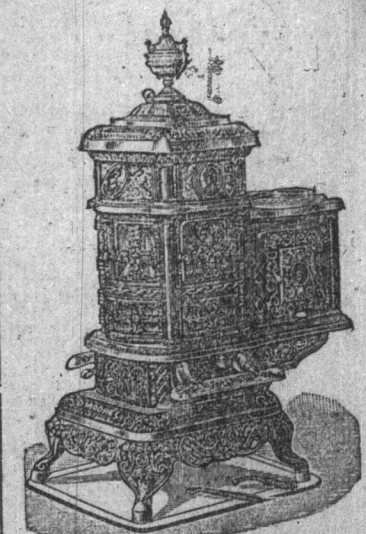
The "KART AMHERST" Best in the market. A few feet with or without oven, at cost.