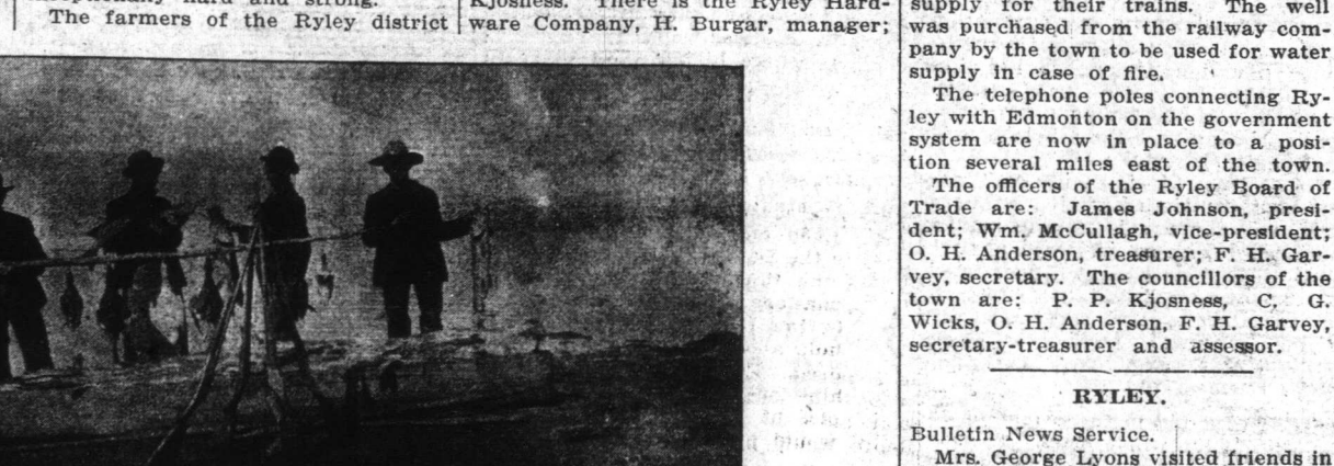
TWO HOURS' FISHING, BEAVER LAKE,