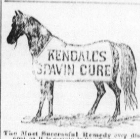
Fig. Most Successful Remedy ever discrete, as it is certain in its effects and does not blister. Read proof below,