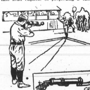
GUN FOR DELIVERING A CURVED BALL.

accurate straight ball is not difficult to make, but when it comes to combining a rotator with the projecting apparatus the problem assumes a different aspect. And even if a solution were arrived at the construction would, for the special purpose for which it is designed, be impracticable, on account of its cumbrous, rature.