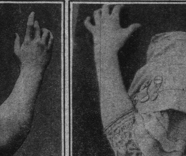
A Sleeve Wideped by Lace Insertion. An Inverted Sleeve with Chiffon under

side a series of four small cape-like pieces overlapping each other about two inches apart. Each of these pieces should be piped or trimmed