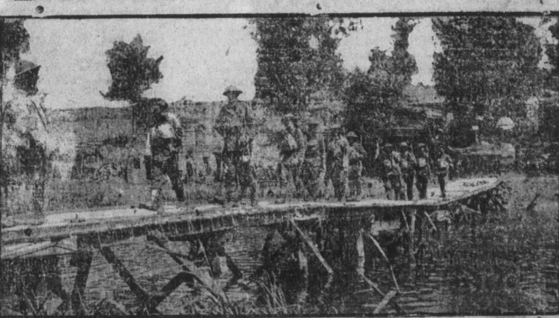
Battle of Menin Road.—Infantry crossing