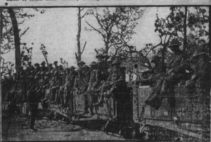
Welsh battalions being conveyed to the front.—They fought magnificently in the storming of Zonnebeke—gaining a time of their objectives. Photos by opurious of O.P. in