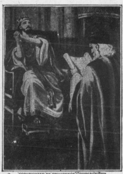
COPYRIGHTED BY PROVIDENCE LITHOGRAPHICOL

Golden Text-I will not forget thy word.—Psalm 119:16.