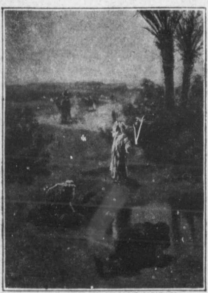
COPYRIGHTED BY PROVIDENCE LITHOGRAPH CO

Golden Text-Seek ye the Lord while he may be found, call ye upon him while he is near.-Isaiah 55:6.