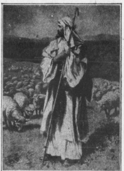
COPYRIGHTED BY PROVIDENCE LITHOGRAPH CO.

Golden Text-The Lord is my shepherd; I'shall not want .- Psalm 23:1.