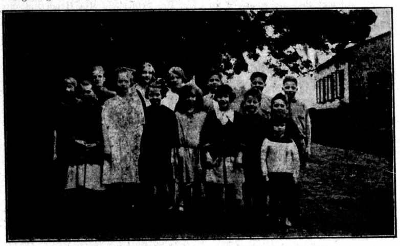
THE BAPTIST CHILDREN IN ATTENDANCE IN 1923

Perhaps the readers will wonder why this article is written. It is because many of our Canadian Baptist people are interested in the school and several of our