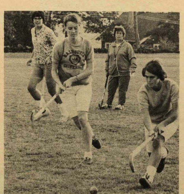
victory to their credit, will travel to U.N.B. The schedule of home games is as follows:

The first game of the season will be played against Mt. St. Bernard at Dal on Fri., Sept. 27. The next weekend, October 4, the team hopefully with one